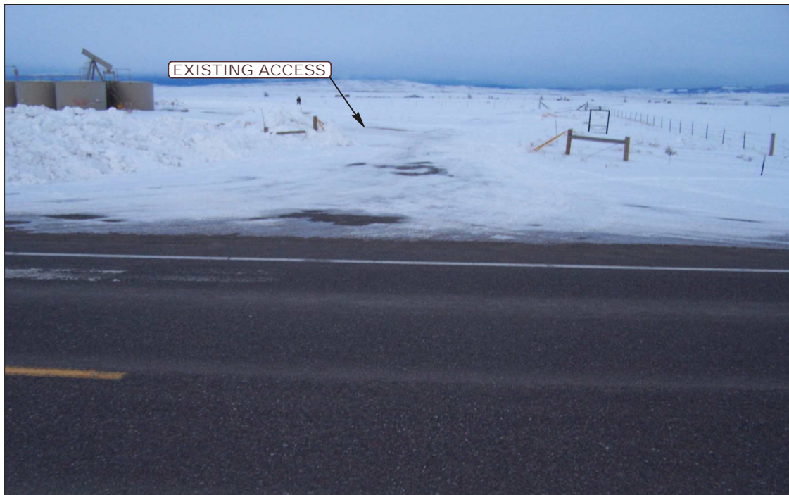
PHOTO: VIEW FROM BEGINNING OF EXISTING ACCESS