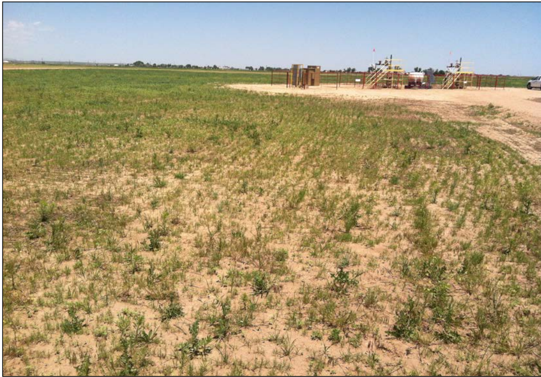
Photograph 1. This is the North facing photograph, as defined in regulation 1003.e.(3). Date Taken: 6/10/2014 GPS Location: 40.131907/-104.632443

Well/Facility Name: Weichel 14N, 28N-11HZ