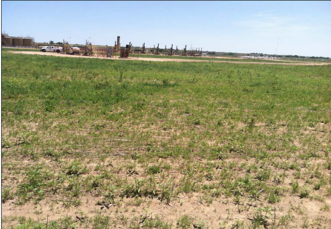
Photograph 3. This is the East facing photograph, as defined in regulation 1003.e.(3). Date Taken: 6/10/2014 GPS Location: 40.131907/-104.632443

Well/Facility Name: Weichel 14N, 28N-11HZ