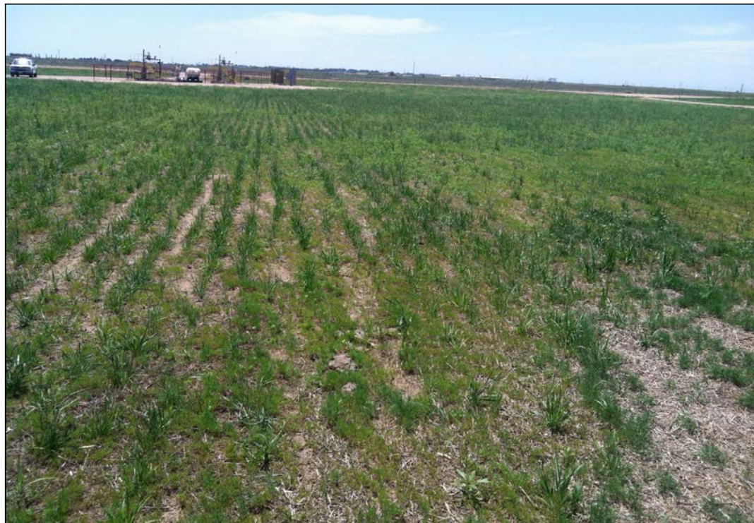
Photograph 2. This is the South facing photograph, as defined in regulation 1003.e.(3). Date Taken: 6/10/2014 GPS Location: 40.131907/-104.632443