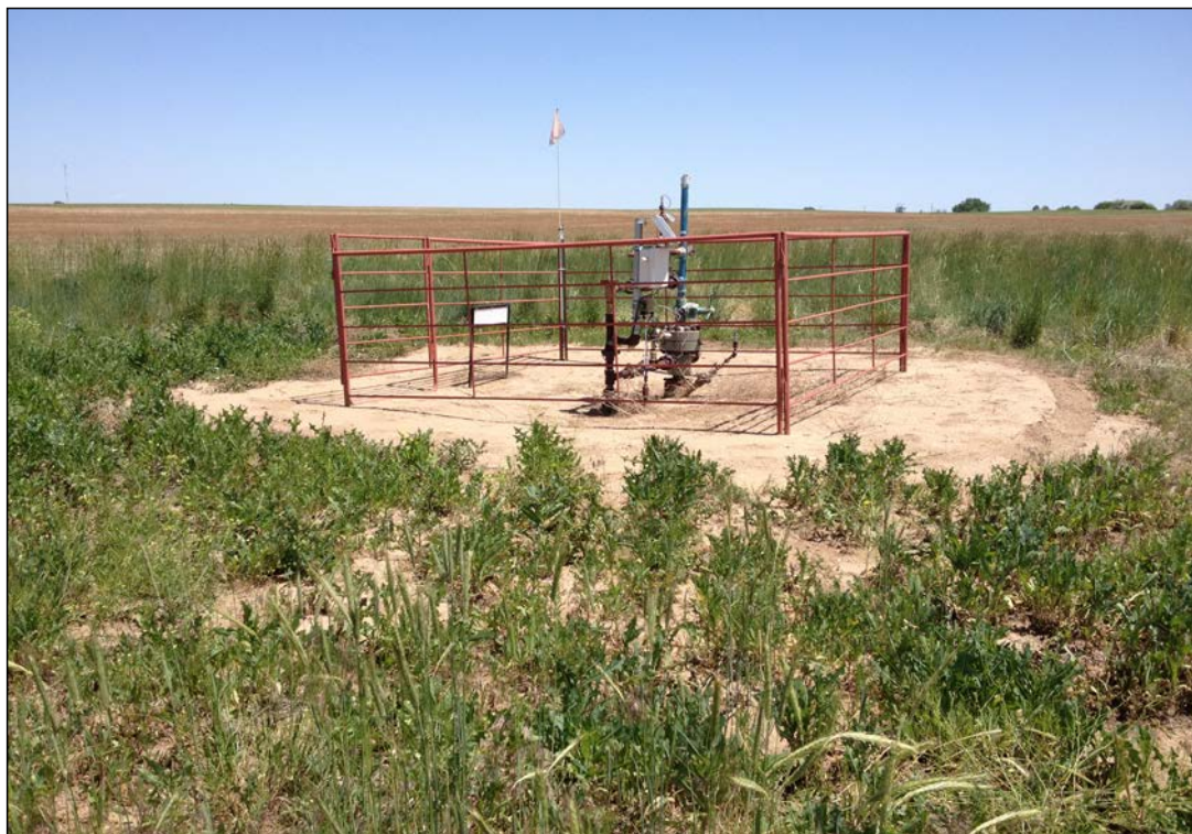
Photograph 3. This is the East facing photograph, as defined in regulation 1003.e.(3). Date Taken: 6/10/2013 GPS Location: 40.248499/-104.727411