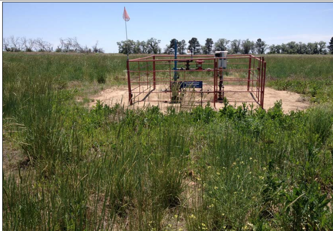
Photograph 2. This is the South facing photograph, as defined in regulation 1003.e.(3).