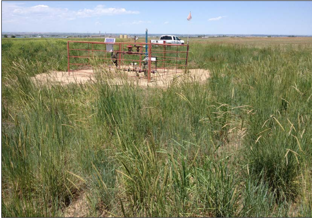
Photograph 1. This is the North facing photograph, as defined in regulation 1003.e.(3).