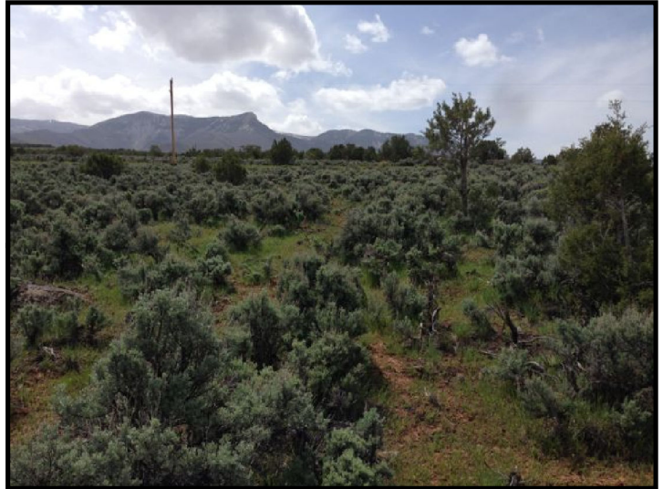
Tompkins Looking South