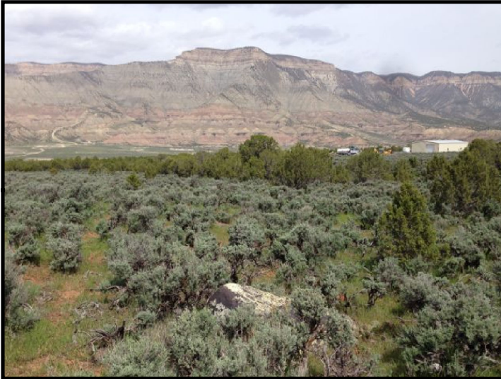
Tompkins Looking North