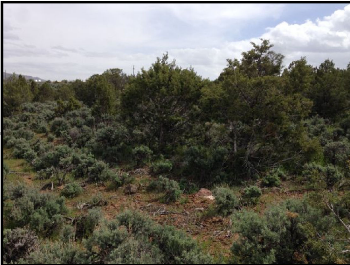
Tompkins Looking East