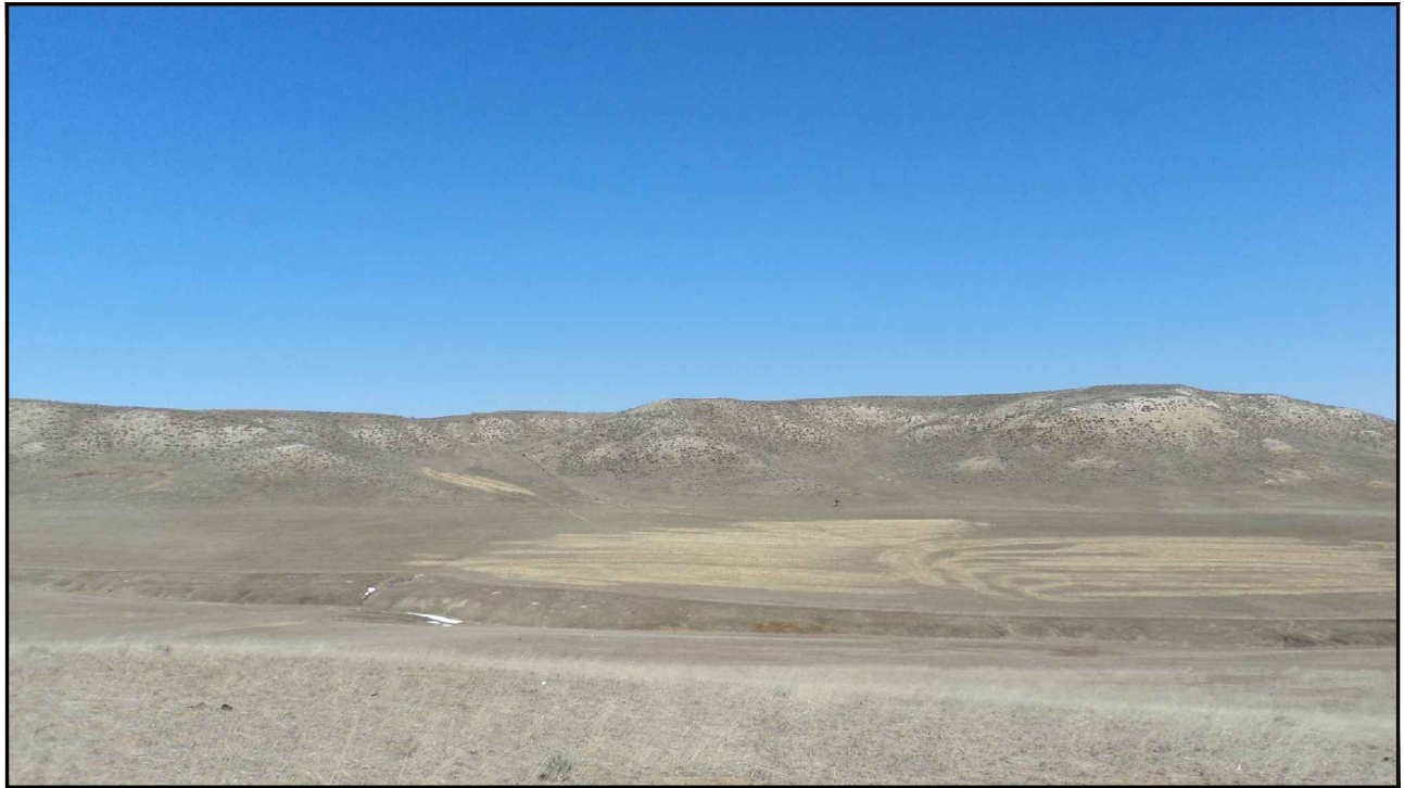
PHOTO: VIEW OF REFERENCE AREA