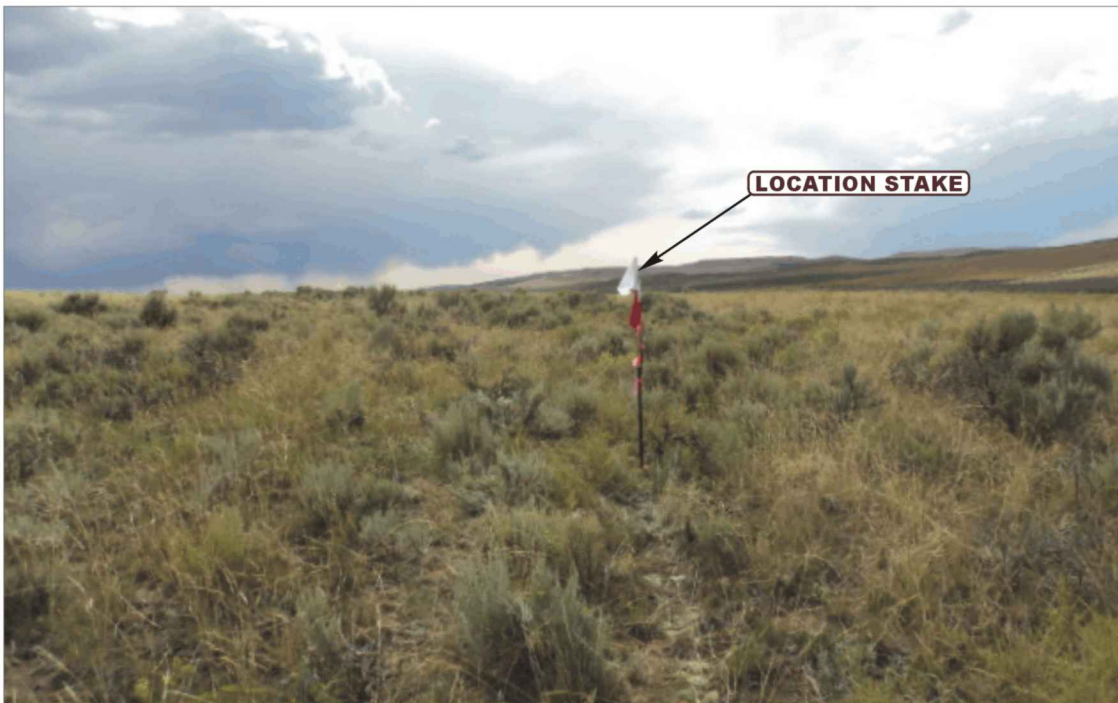
PHOTO: VIEW OF LOCATION STAKE