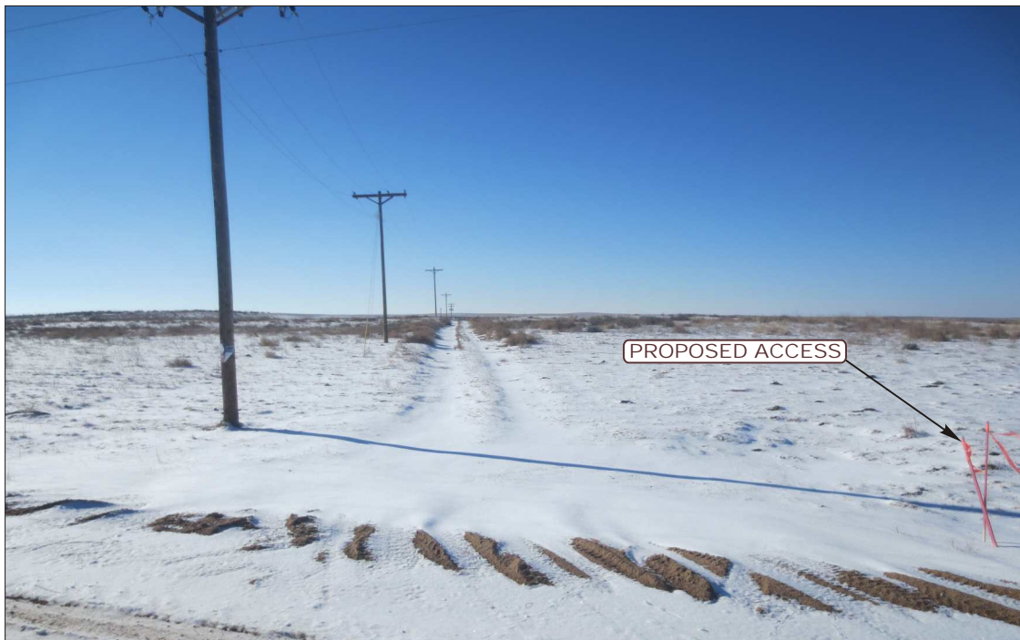
PHOTO: VIEW FROM BEGINNING OF PROPOSED ACCESS FOR THE ANSCHUTZ EQUUS FARMS N2N2 4-62-33_34 PAD