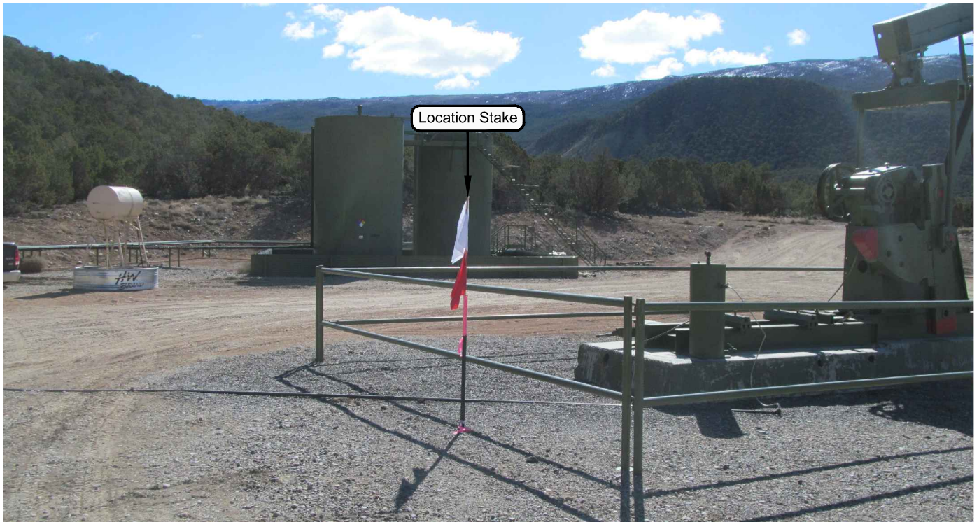
PHOTO LOCATION: LATITUDE LONGITUDE NAD 83: (38° 57' 55.87"N) (108° 14' 00.83"W)