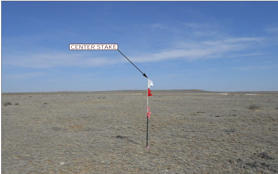
PHOTO: VIEW OF CENTER STAKE