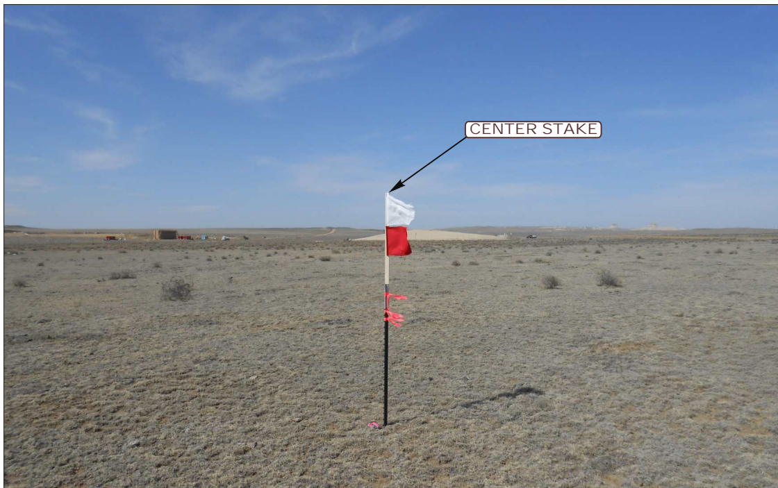
PHOTO: VIEW OF CENTER STAKE