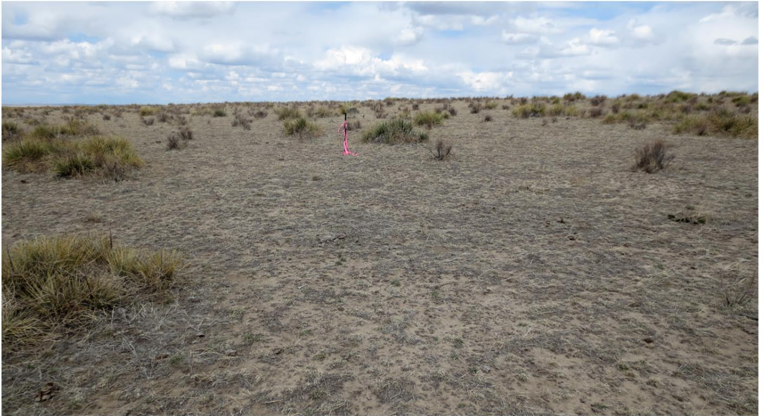
WELL PAD VIEW (LOOKING NORTH)