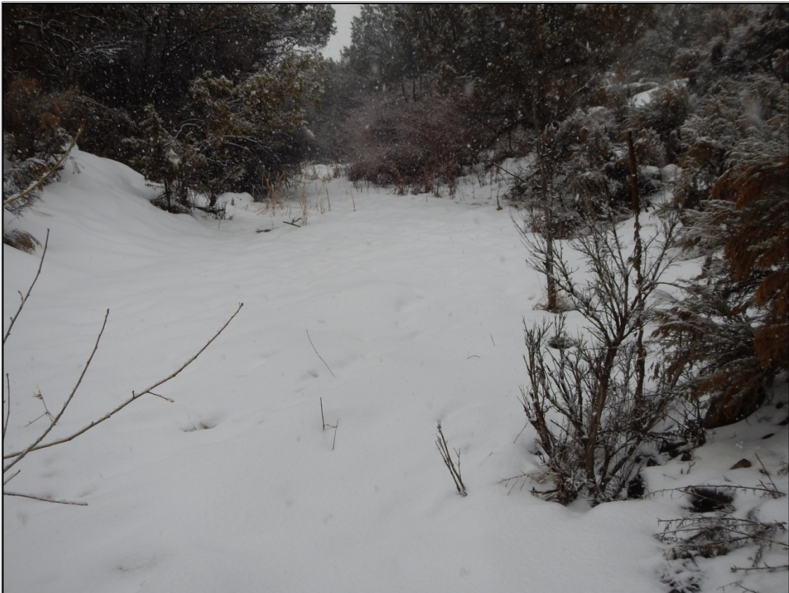
Photograph 2. Drainage downstream of sampling location K3 (January 30, 2014)