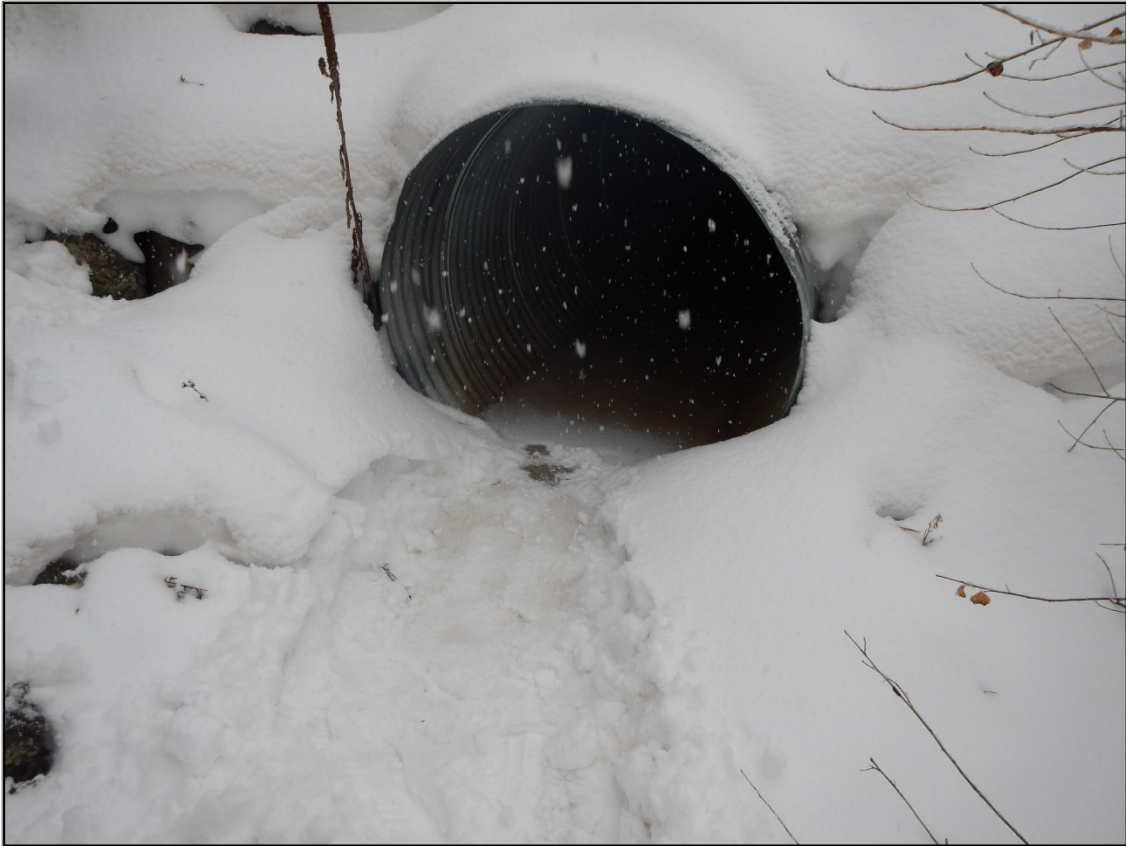
Photograph 1. Sampling location K3 (January 30, 2014)