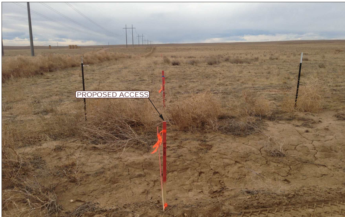
PHOTO: VIEW FROM BEGINNING OF PROPOSED FIDUCIAL 6-62-34 ROAD