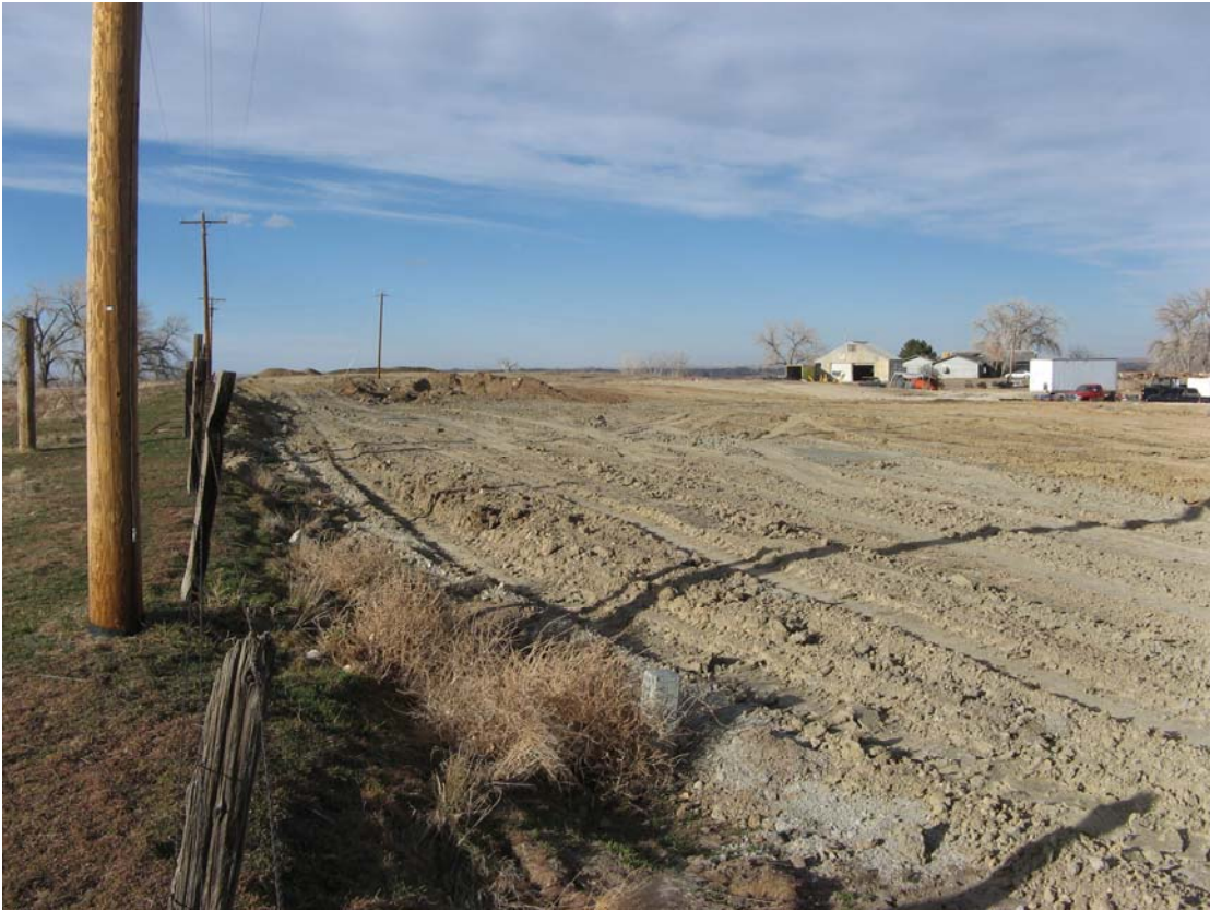
Material recently placed and spread with grader - 8201 160 th Ave., Brighton, CO 80602 NWSE Sec 4, T1S, R67W, Adams County Looking North