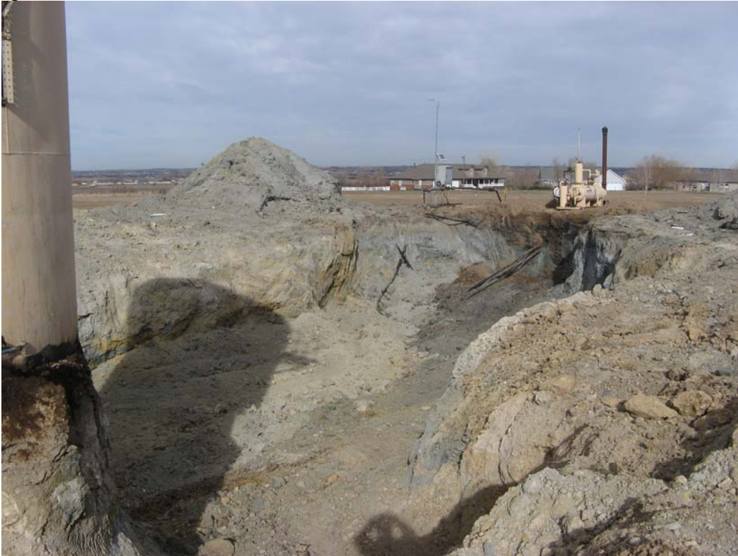
Texas Tea Remediation Blow-Moore 3-1, API #001-08775 Tank Battery Location Coordinates N 39.988546, W -104.86964 Looking East