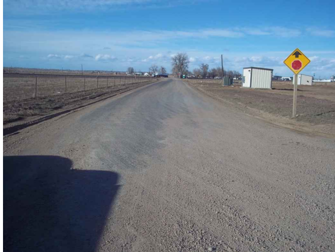
VIEW NORTH (CR 33)