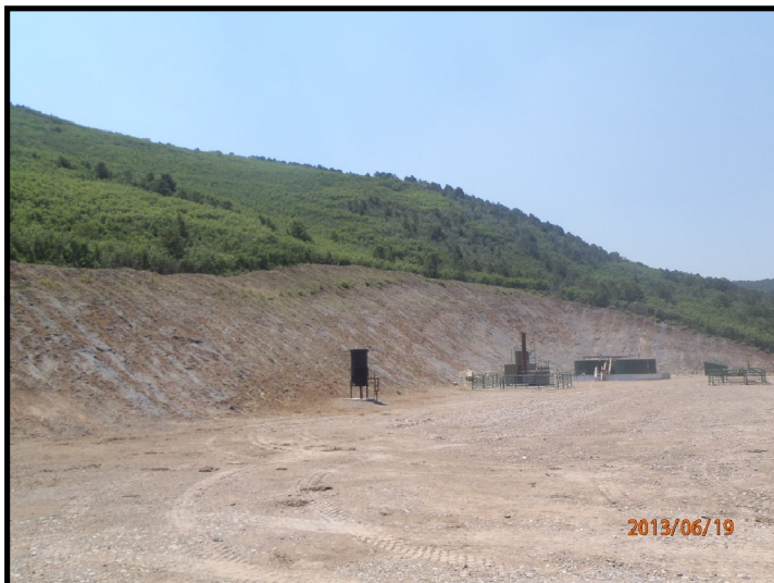
Castle Springs Federal E Pad Looking South