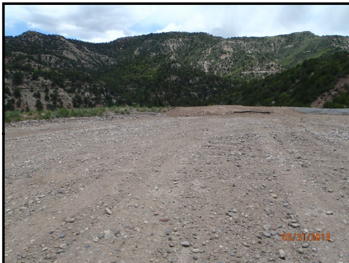
Castle Springs Federal E Pad Looking East