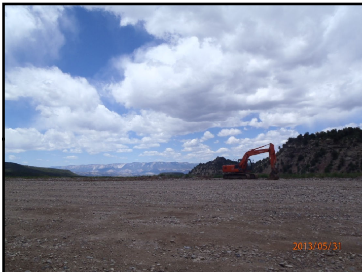
Castle Springs Federal E Pad Looking North