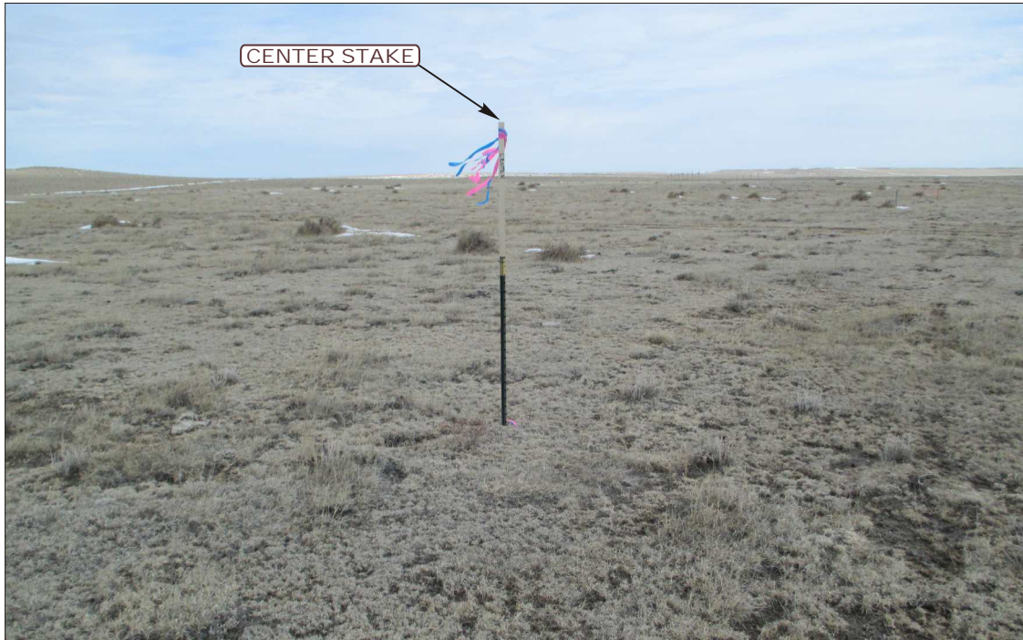
PHOTO: VIEW OF CENTER STAKE