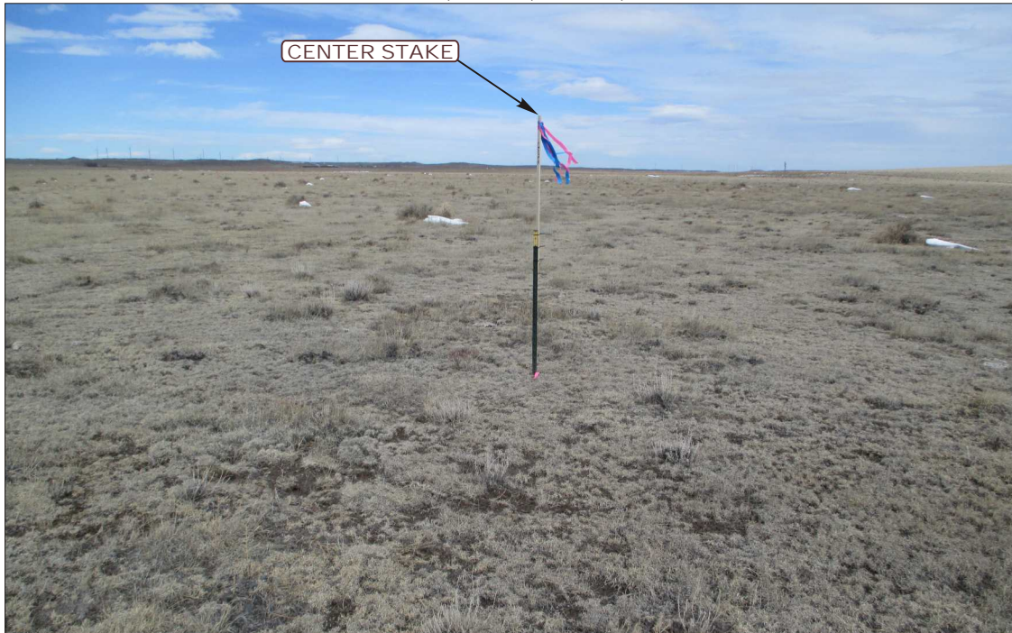
PHOTO: VIEW OF CENTER STAKE

LOCATED IN WELD COUNTY, COLORADO SECTION 30, T10N, R57W, 6th P.M.