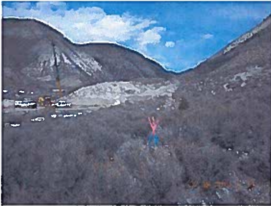
REFERENCE AREA LOOKING NORTH 2/19/2014