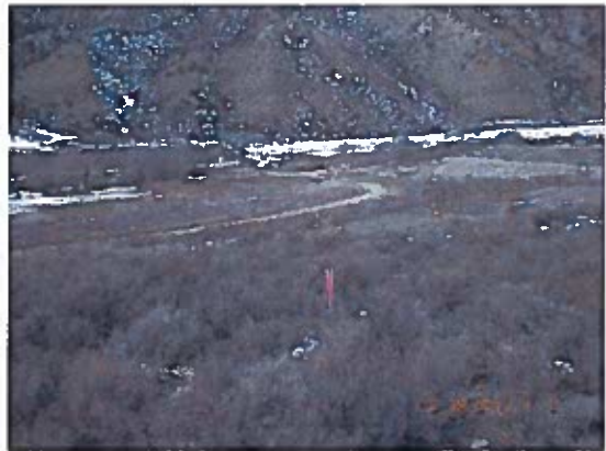
REFERENCE AREA LOOKING WEST 2/19/2014

REFERENCE AREA CENTER STAKE (DO NOT DISTURB) LATITUDE (NAD 83) NORTH 39.467135 DEG LONGITUDE (NAD 83) WEST 108.243387 DEG