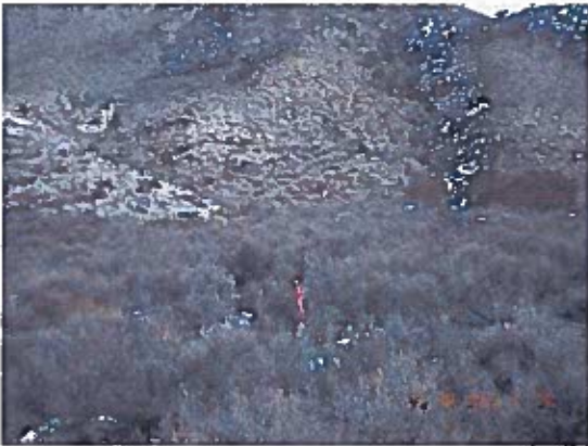
REFERENCE AREA LOOKING EAST 2/19/2014