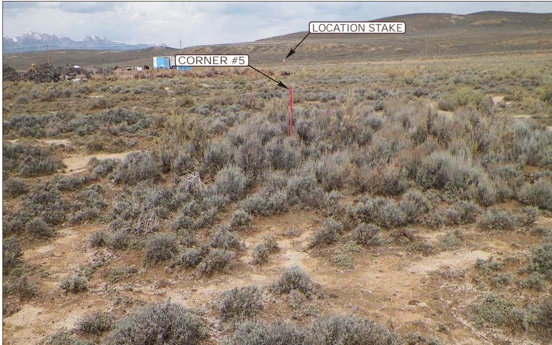
PHOTO: VIEW OF LOCATION STAKES

LOCATED IN JACKSON COUNTY, COLORADO SECTION 10, T8N, R80W, 6th P.M.