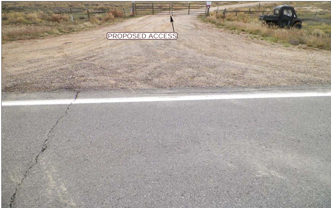
PHOTO: VIEW FROM BEGNNING OF PROPOSED ACCESS