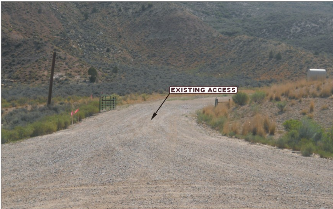
PHOTO: VIEW OF EXISTING ACCESS