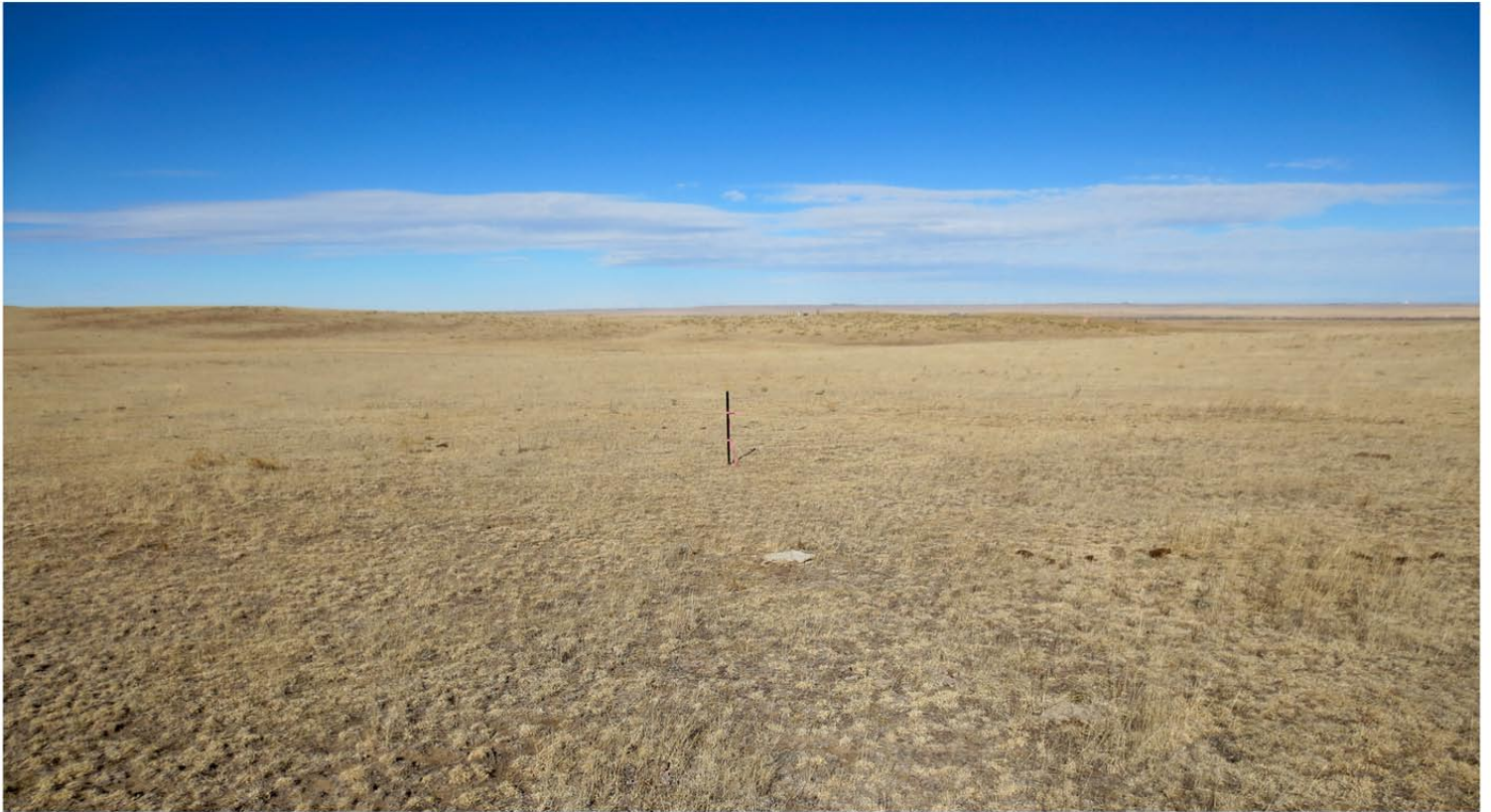
WELL PAD VIEW (LOOKING NORTH)