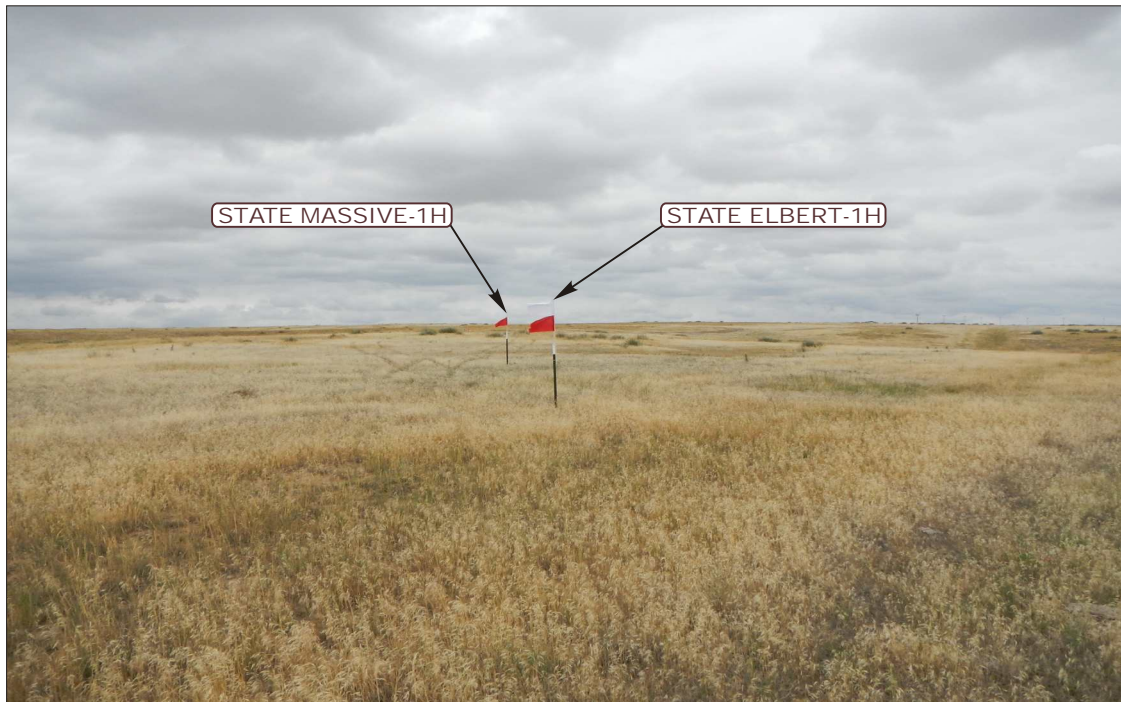
PHOTO: VIEW OF LOCATION STAKES