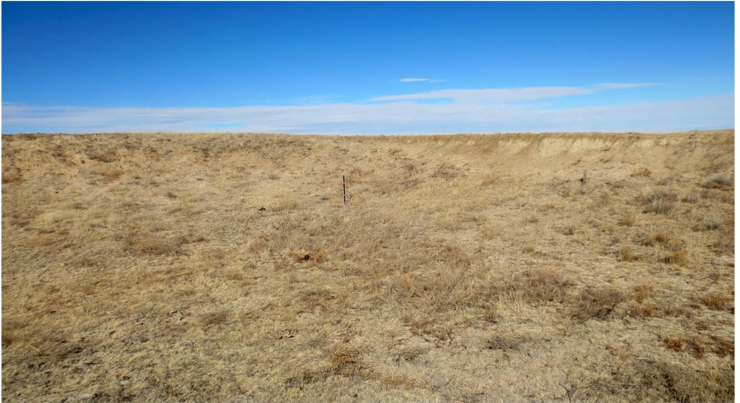
WELL PAD VIEW (LOOKING NORTH)