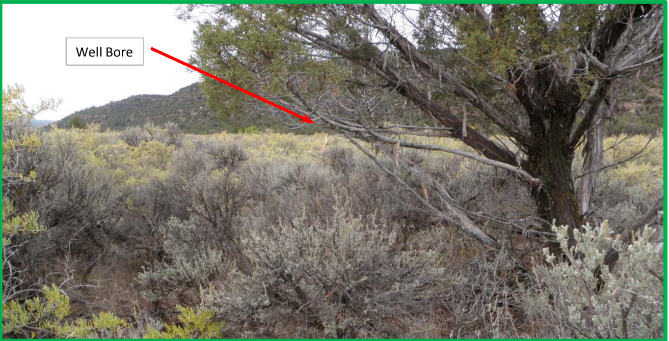
Photo No. : 7-23D - Photo Date: 10/13/12 Photo Desc: Looking West toward HDU 7-23AH Well Bore Camera Station: 39.371980226° N, 108.369640770° W Station Desc: 50' East of HDU 7-23AH Well Bore

Exhibit VA-1 (1 of 2): Well Site Photos Homer Deep Unit 7-23AH NE¼ SW¼, Section 7, T. 8 S., R. 98 W. Garfield County, Colorado