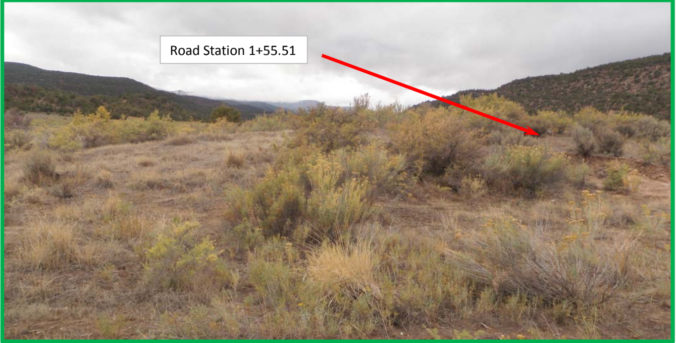
Photo No. : 7-23B - Photo Date: 10/13/12 Photo Desc: Looking Up Station on Proposed Road Camera Station: 39.372375453° N, 108.367513856° W Station Desc: Station 0+00 of Proposed Road