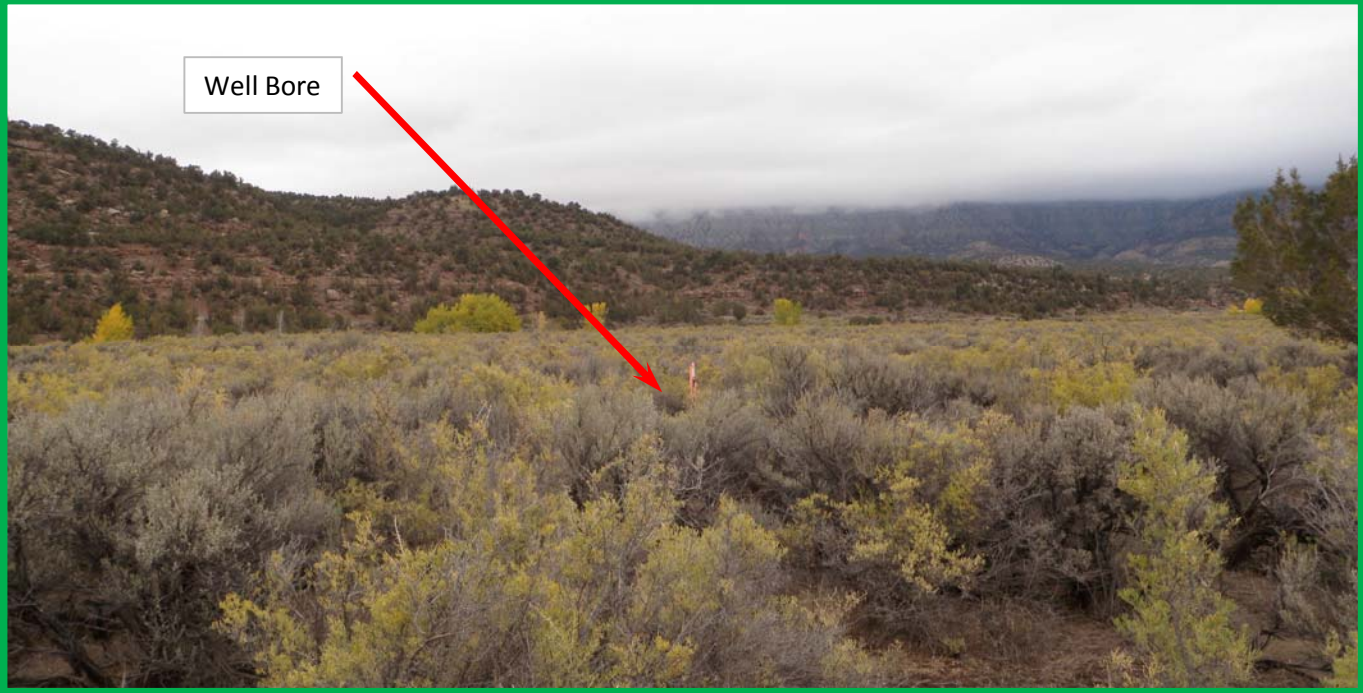
Photo No. : 7-23C - Photo Date: 10/13/12 Photo Desc: Looking North toward HDU 7-23AH Well Bore Camera Station: 39.371842942° N, 108.369817368° W Station Desc: 50' South of HDU 7-23AH Well Bore