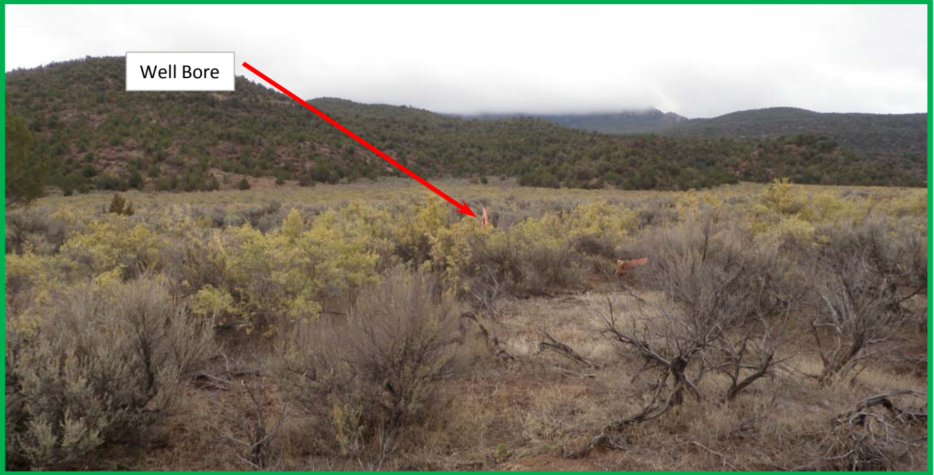
Photo No. : 7-23E - Photo Date: 10/13/12 Photo Desc: Looking South toward HDU 7-23AH Well Bore Camera Station: 39.372117422° N, 108.369817490° W Station Desc: 50' North of HDU 7-23AH Well Bore