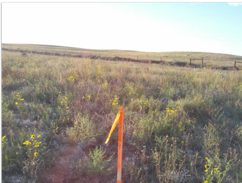
#1 - NORTHWESTERLY PERSPECTIVE