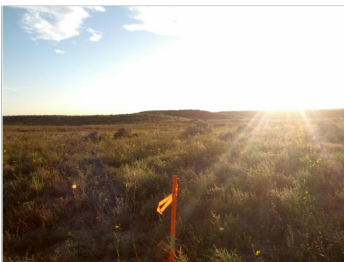
#3 - SOUTHWESTERLY PERSPECTIVE