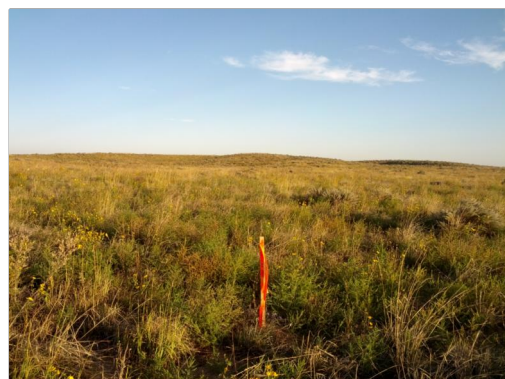
#4 - SOUTHEASTERLY PERSPECTIVE