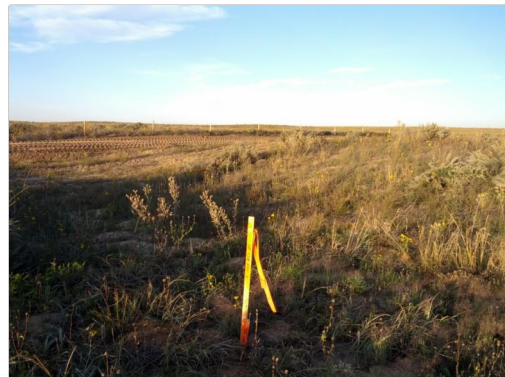
#2 - NORTHEASTERLY PERSPECTIVE