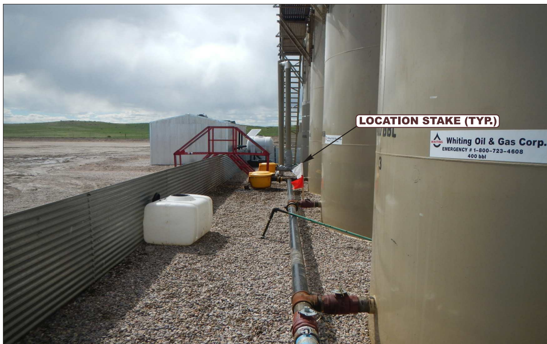
PHOTO: VIEW OF LOCATION STAKE