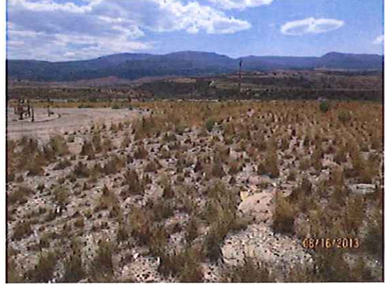
PAD LOCATION LOOKING SOUTH