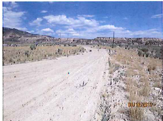
PAD ACCESS LOOKING NORTHEASTERLY

KS2012 WILLIAMS VALLEY Clough 2A Photo Sheet.dwg, 8/16/2013 2:52:41 PM