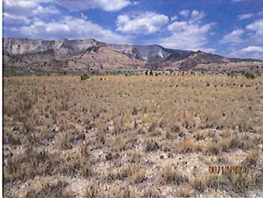
PAD LOCATION LOOKING NORTH