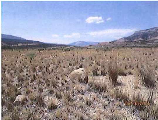
PAD LOCATION LOOKING WEST