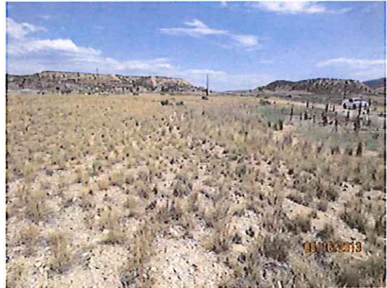
PAD LOCATION LOOKING EAST