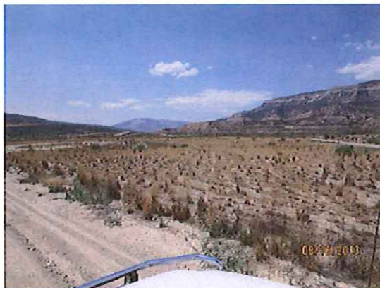
PAD OVERALL LOOKING WESTERLY