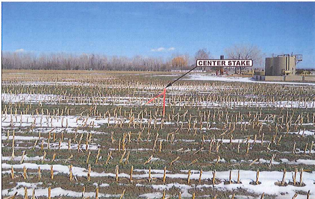
PHOTO: VIEW OF CENTER STAKE