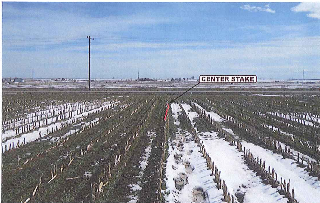
PHOTO: VIEW OF CENTER STAKE