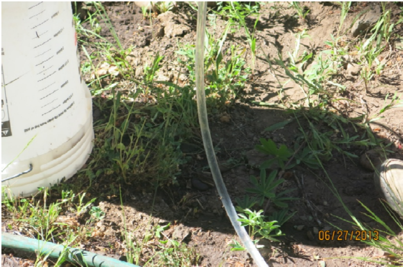
Photo 9 Gas Bubbles in Sampling Hose