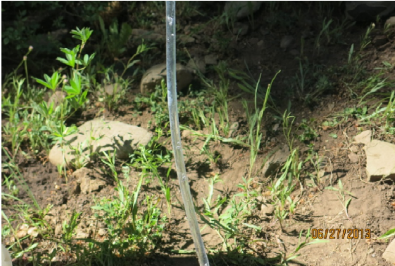
Photo 7 Gas Bubbles in Sampling Hose