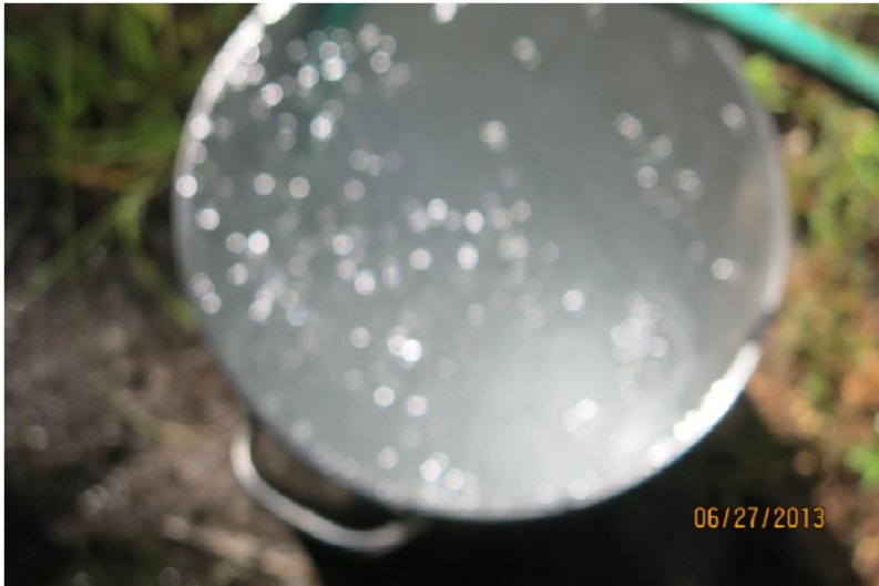
Photo 3 Gas Bubbles in Stainless Steel Vessel