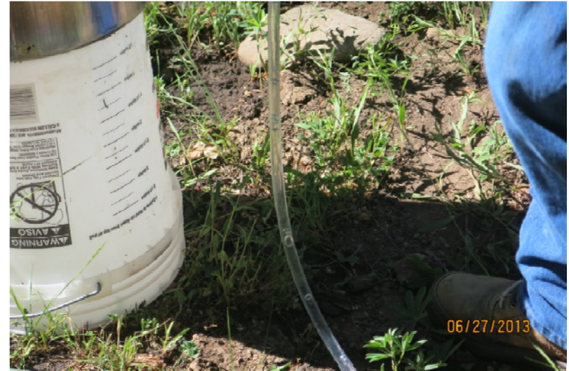
Photo 8 Gas Bubbles in Sampling Hose