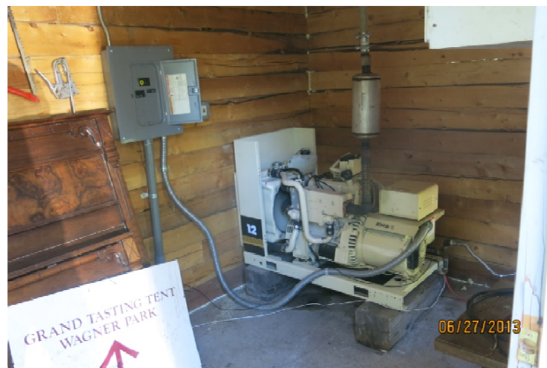
Photo 6 Generator Inside Pump House