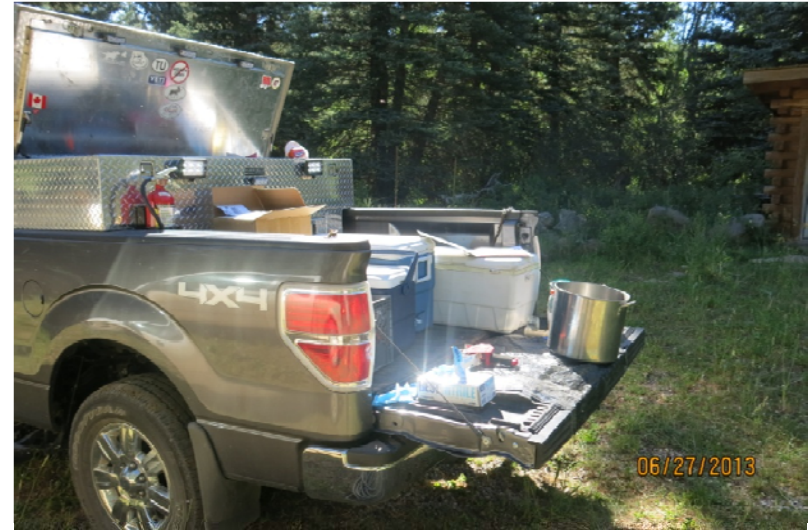
Photo 2 ESI F-150 and Sample Preparation Station