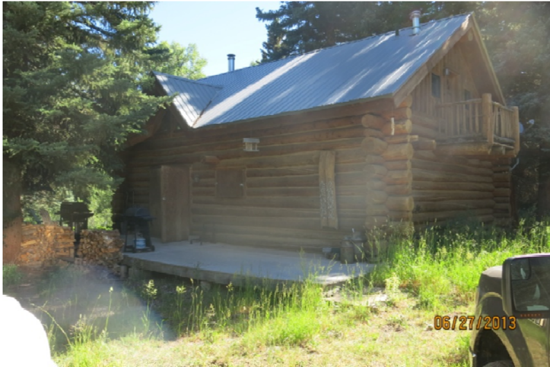
Photo 1 Werning Cabin