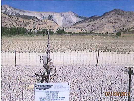
PAD LOCATION LOOKING NORTH