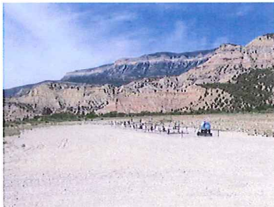
PAD OVERALL LOOKING NORTHWESTERLY