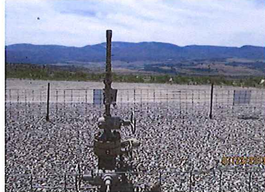
PAD LOCATION LOOKING SOUTH