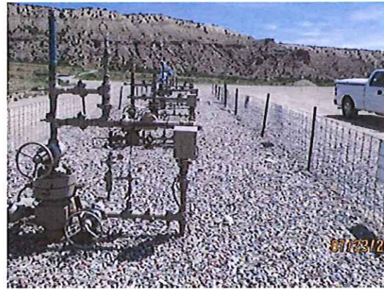
PAD LOCATION LOOKING EAST