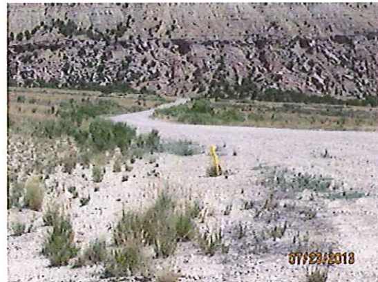
PAD ACCESS LOOKING EASTERLY