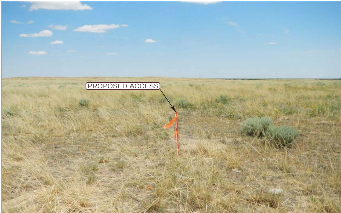
PHOTO: VIEW FROM BEGINNING OF PROPOSED ACCESS