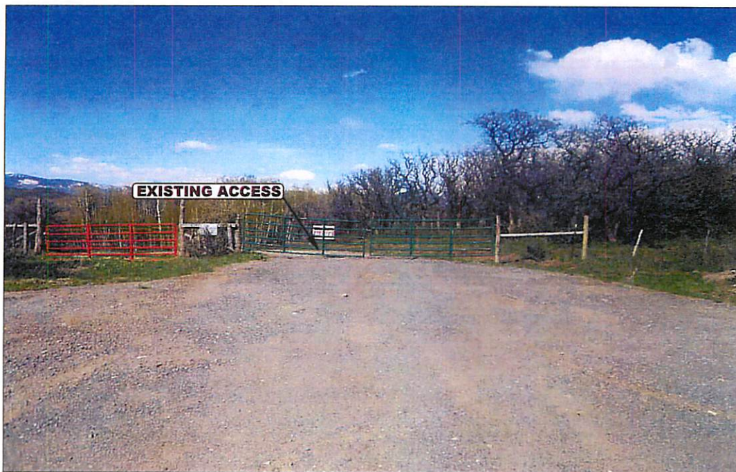
PHOTO: VIEW FROM BEGINNING OF EXISTING ACCESS