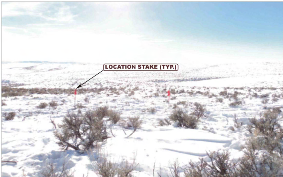
PHOTO: VIEW OF LOCATION STAKE