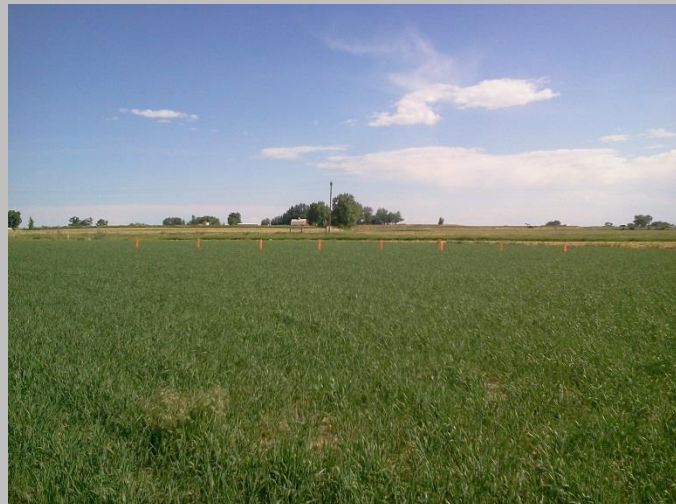
Edith Ann-Duckworth Wells • South View