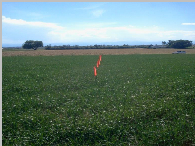
Edith Ann-Duckworth Wells • West View

Date of Photography: June 6, 2013 Surface use is a cultivated field