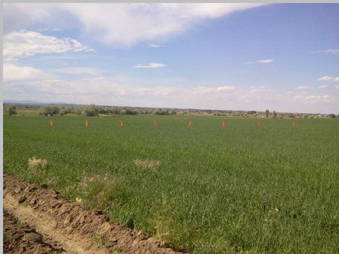
Edith Ann-Duckworth Wells • North View

Surface location: South ½ of the SE ¼ of Section 21-T2N-R68W-6 th PM, Weld County, Colorado