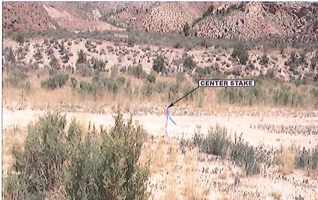
PHOTO: VIEW OF CENTER STAKE

LOCATED IN GARFIELD COUNTY, COLORADO SECTION 28, T6S, R96W, 6th P.M.