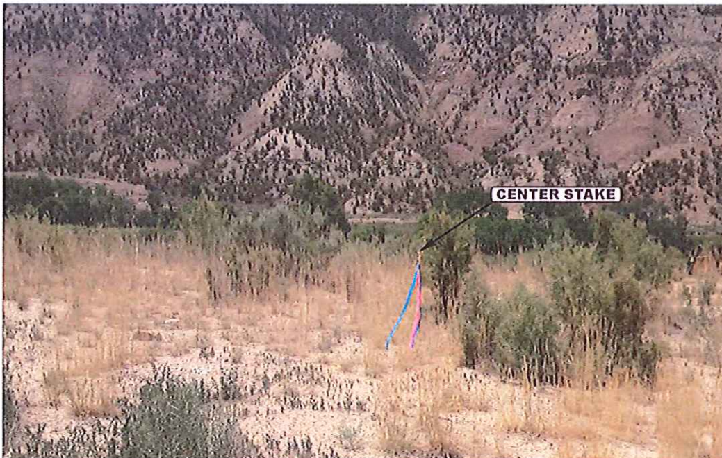
PHOTO: VIEW OF CENTER STAKE