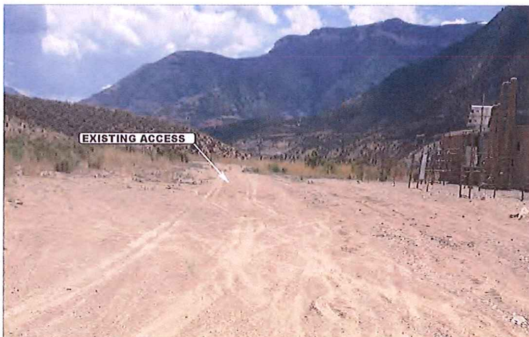
PHOTO: VIEW FROM BEGINNING OF PROPOSED ACCESS