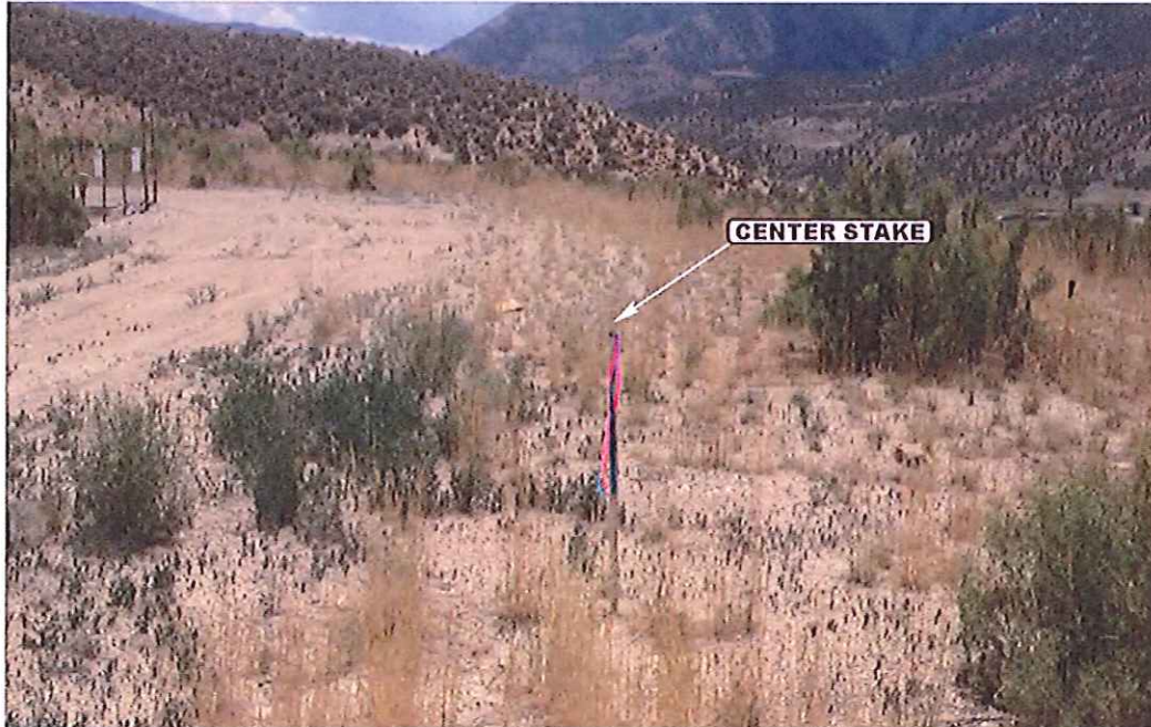
PHOTO: VIEW OF CENTER STAKE

LOCATED IN GARFIELD COUNTY, COLORADO SECTION 28, T6S, R96W, 6th P.M.