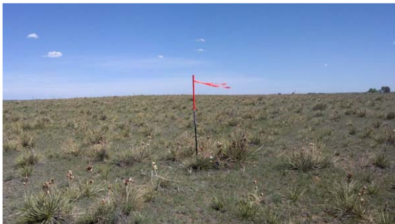
LOOKING NORTH 6/3/13

SECTION 1, TOWNSHIP 13 SOUTH, RANGE 60 WEST OF THE 6TH PRINCIPAL MERIDIAN