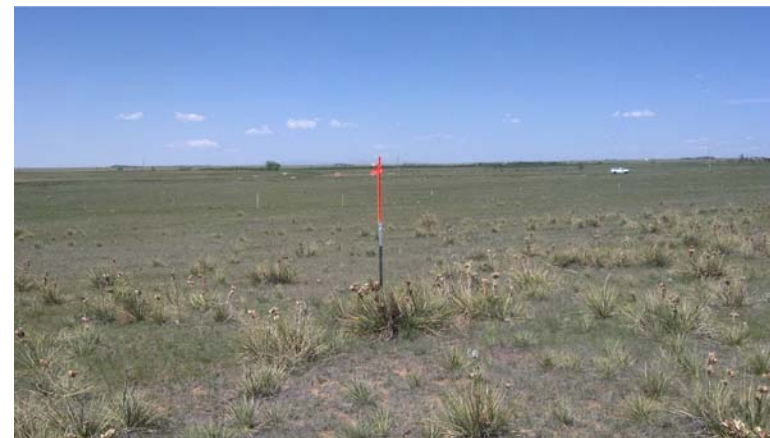
LOOKING WEST 6/3/13