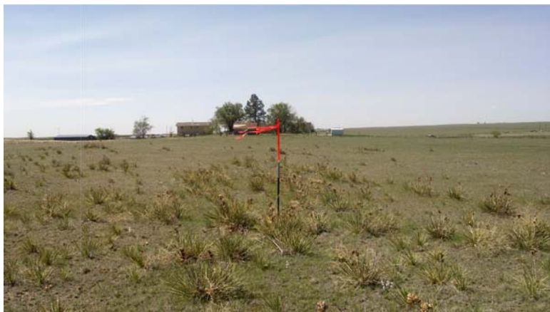
LOOKING SOUTH 6/3/13