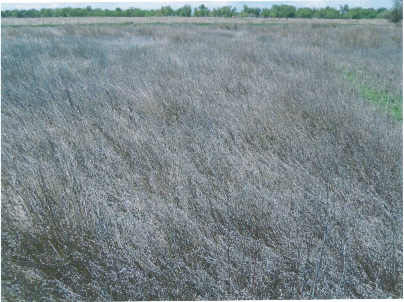
REFERENCE VIEW WEST