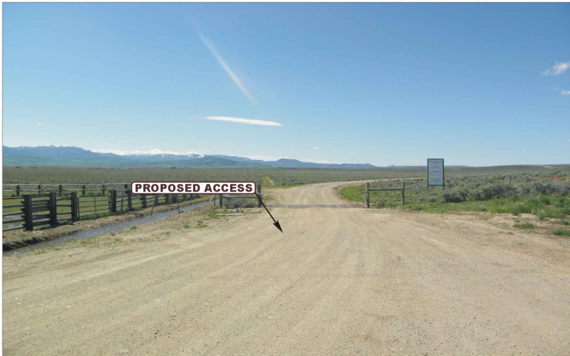
PHOTO: VIEW OF EXISTING ROAD