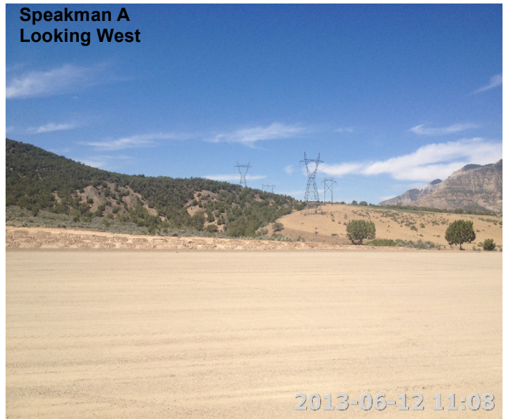
Speakman A Looking West