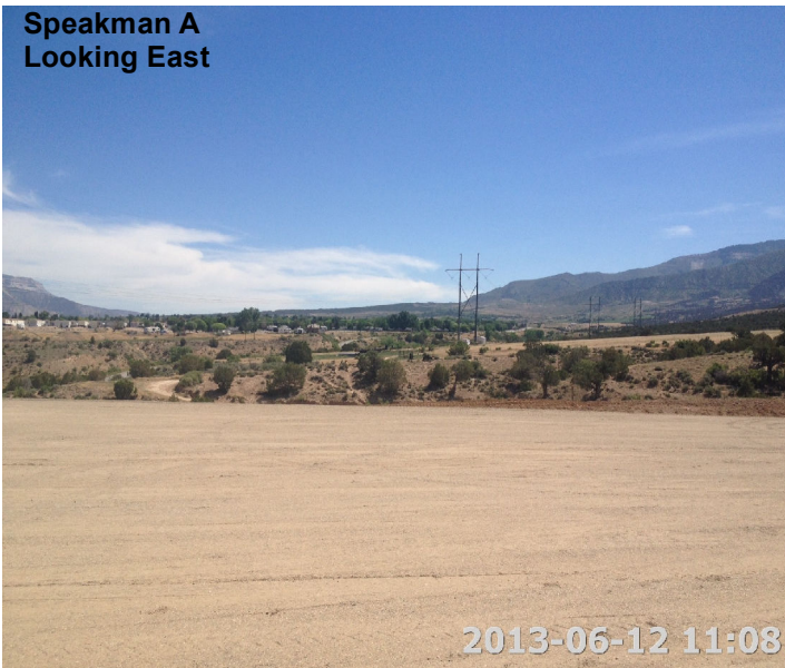
Speakman A Looking East