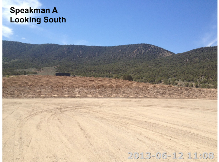
Speakman A Looking South