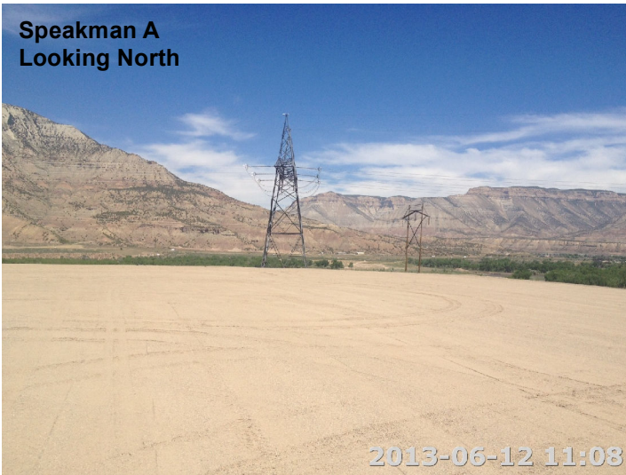
Speakman A Looking North