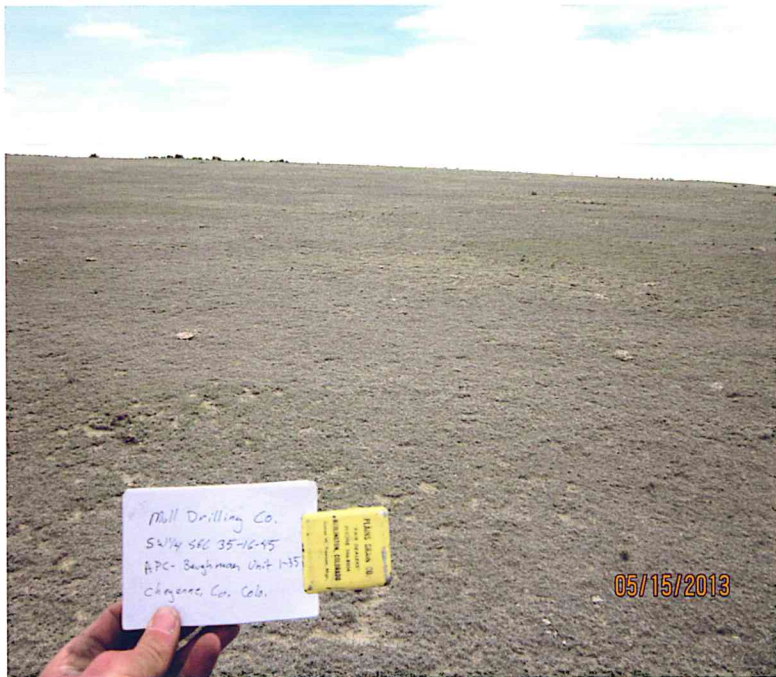
APC-Baughman Unit 1-35 Reference Looking East