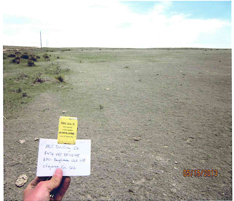
APC-Baughman Unit 1-35 Reference Looking North