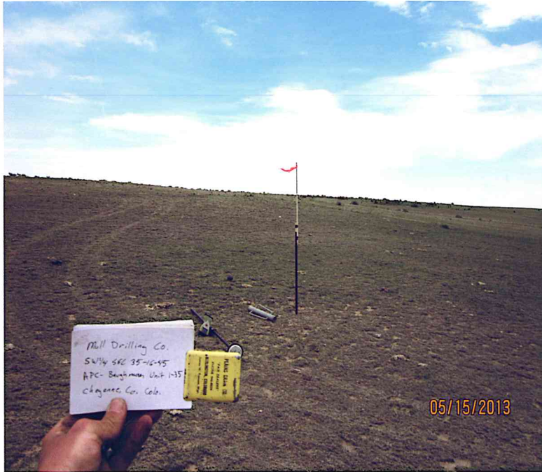
APC-Baughman Unit 1-35 Looking East