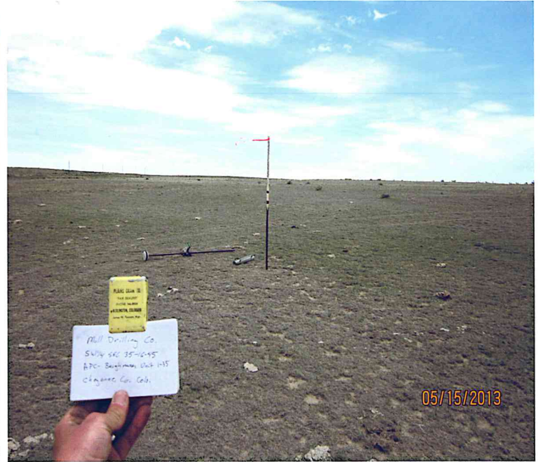
APC-Baughman Unit 1-35 Looking North