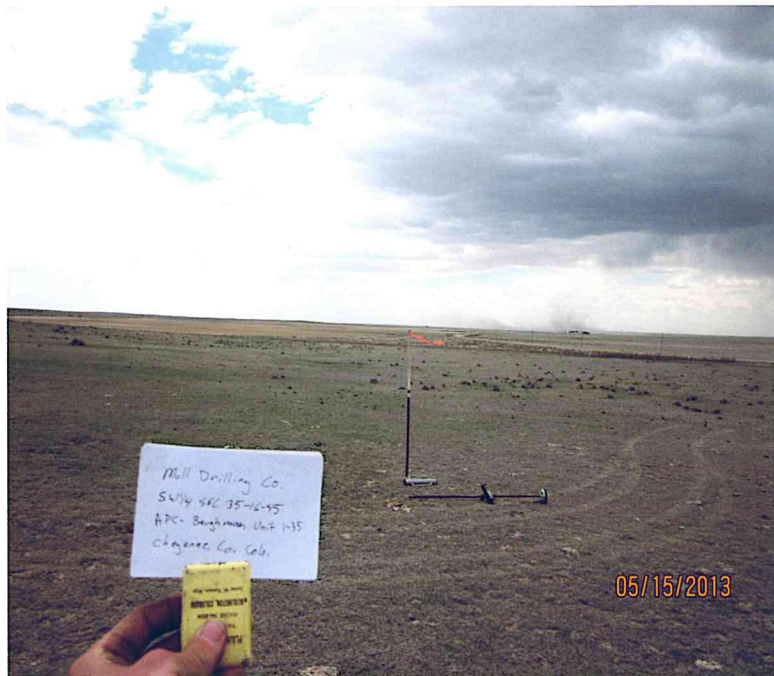
APC-Baughman Unit 1-35 Looking South