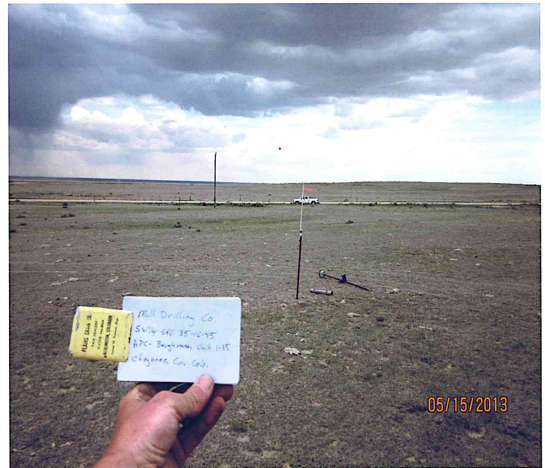
APC-Baughman Unit 1-35 Looking West