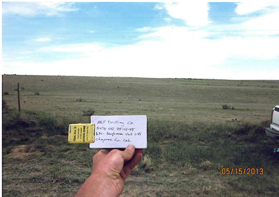
APC-Baughman Unit 1-35 Ingress Looking West