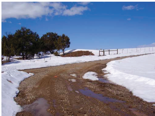
Access at Well Location