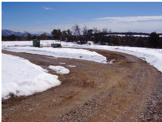
Access at Road