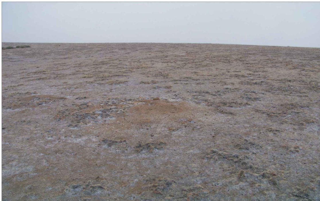
PHOTO: VIEW OF REFERENCE AREA