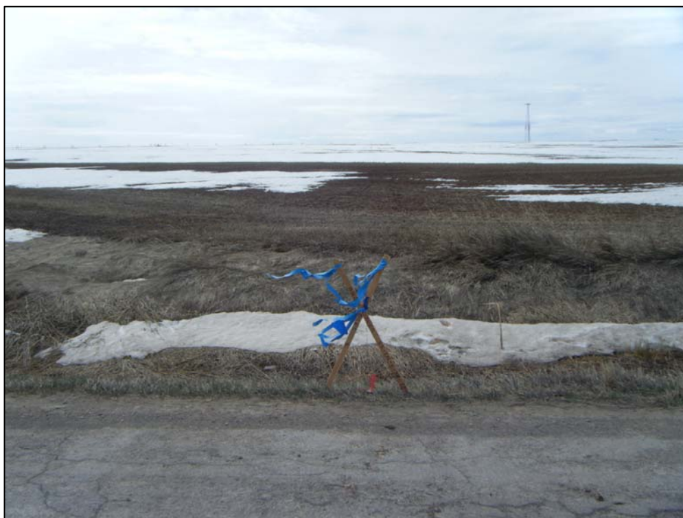
BEGINNING OF ACCESS ROAD LOOKING SOUTH (3/23/10)