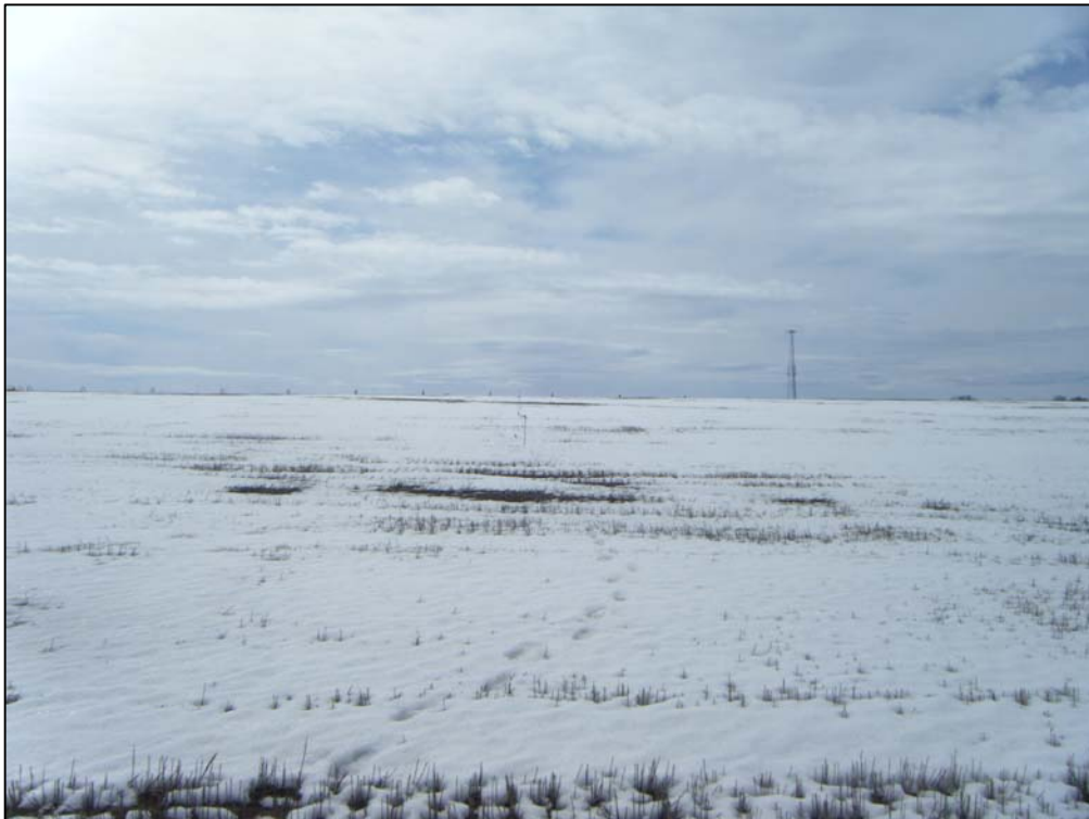
PAD LOCATION LOOKING SOUTH (3/23/10)