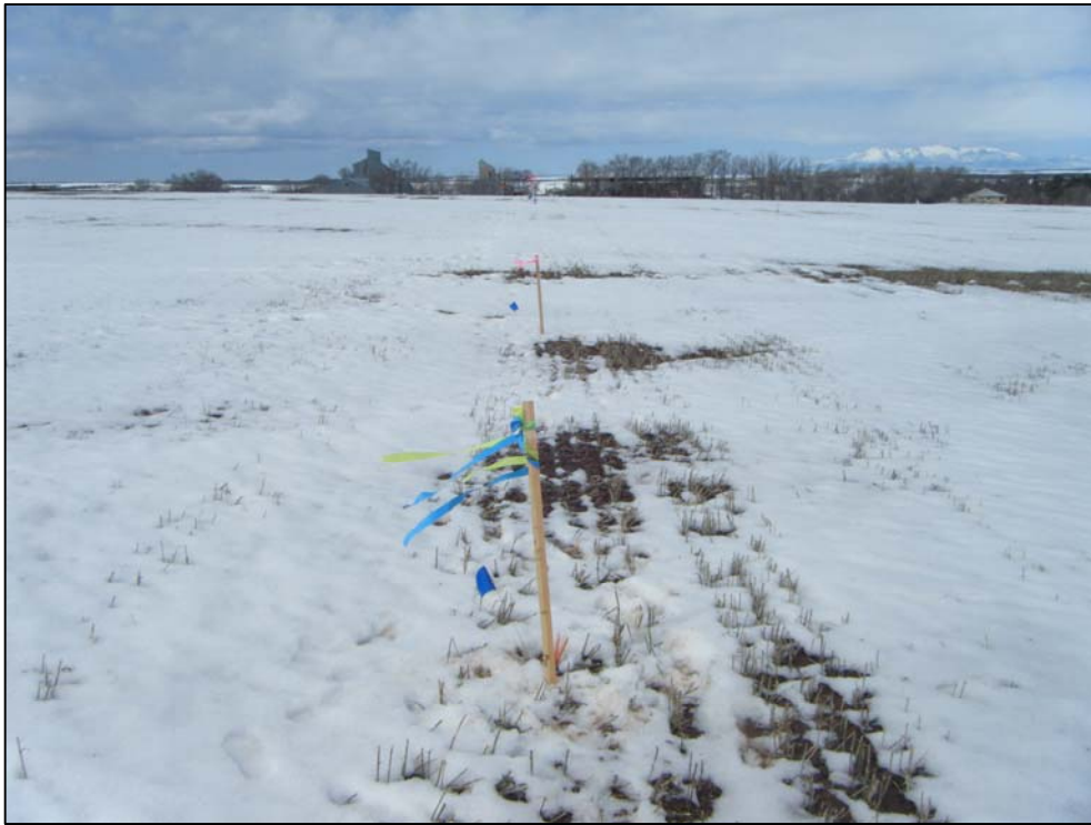
PAD LOCATION LOOKING WEST (3/23/10)