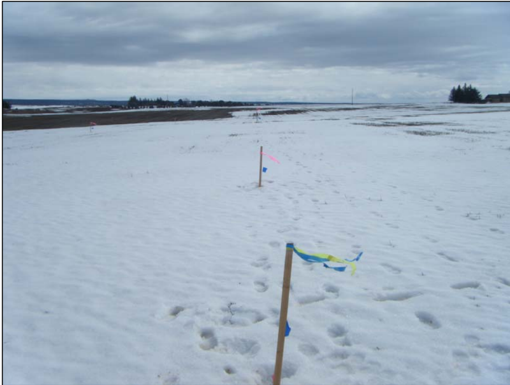
PAD LOCATION LOOKING EAST(3/23/10)