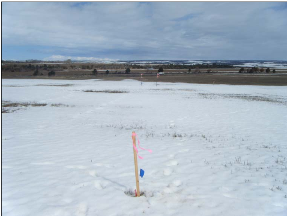
PAD LOCATION LOOKING NORTH (3/23/10)