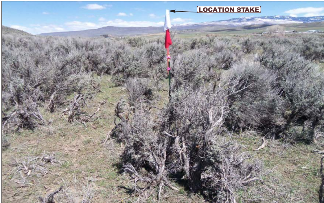
PHOTO: VIEW OF LOCATION STAKE