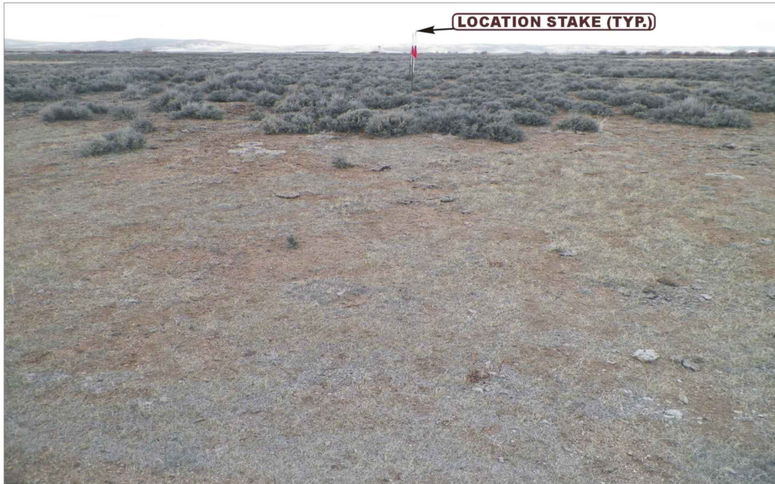
PHOTO: VIEW OF LOCATION STAKES