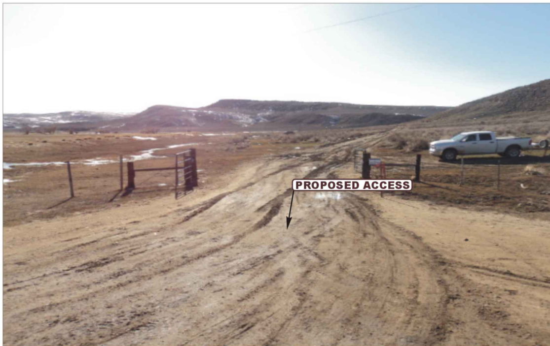
PHOTO: VIEW FROM BEGINNING OF THE PROPOSED ACCESS