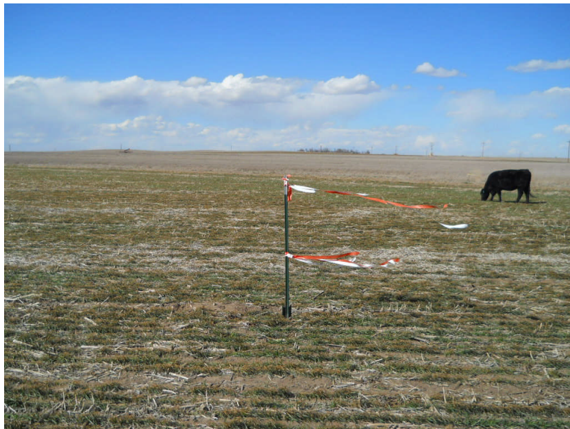
Crossland 43-28 5N46W NE ¼ SE ¼ SEC. 28, T5N, R46W Looking North 03 April, 2013