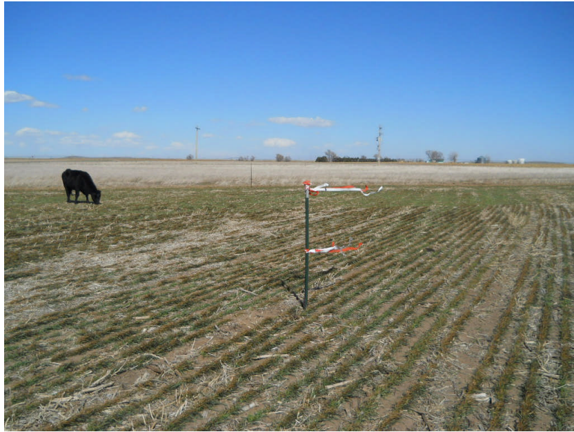
Crossland 43-28 5N46W NE ¼ SE ¼ SEC. 28, T5N, R46W Looking East 03 April, 2013