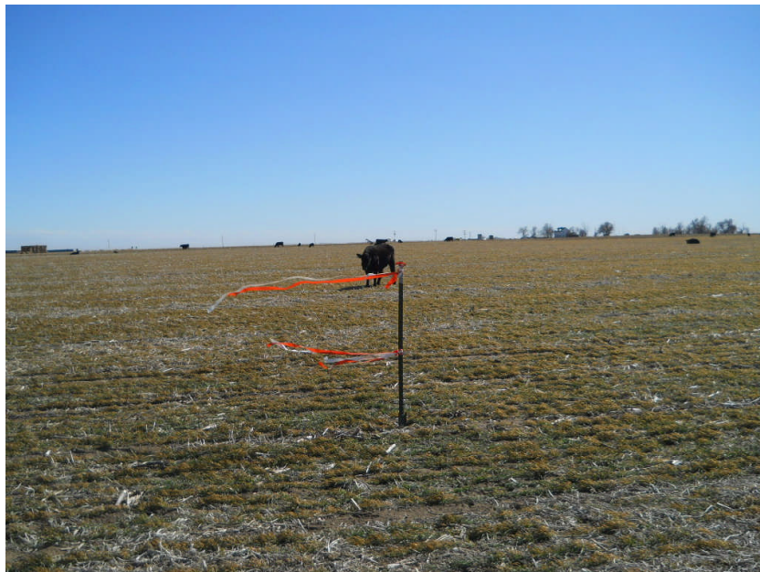
Crossland 43-28 5N46W NE ¼ SE ¼ SEC. 28, T5N, R46W Looking South 03 April, 2013