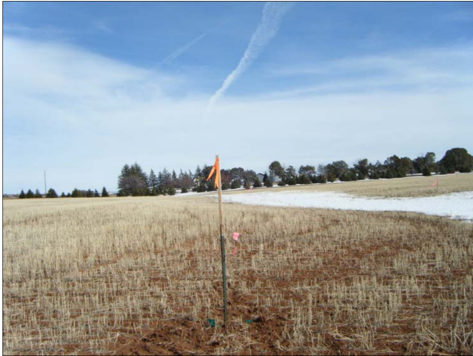
VIEW OF CENTER STAKE LOOKING EAST (2/05/09)