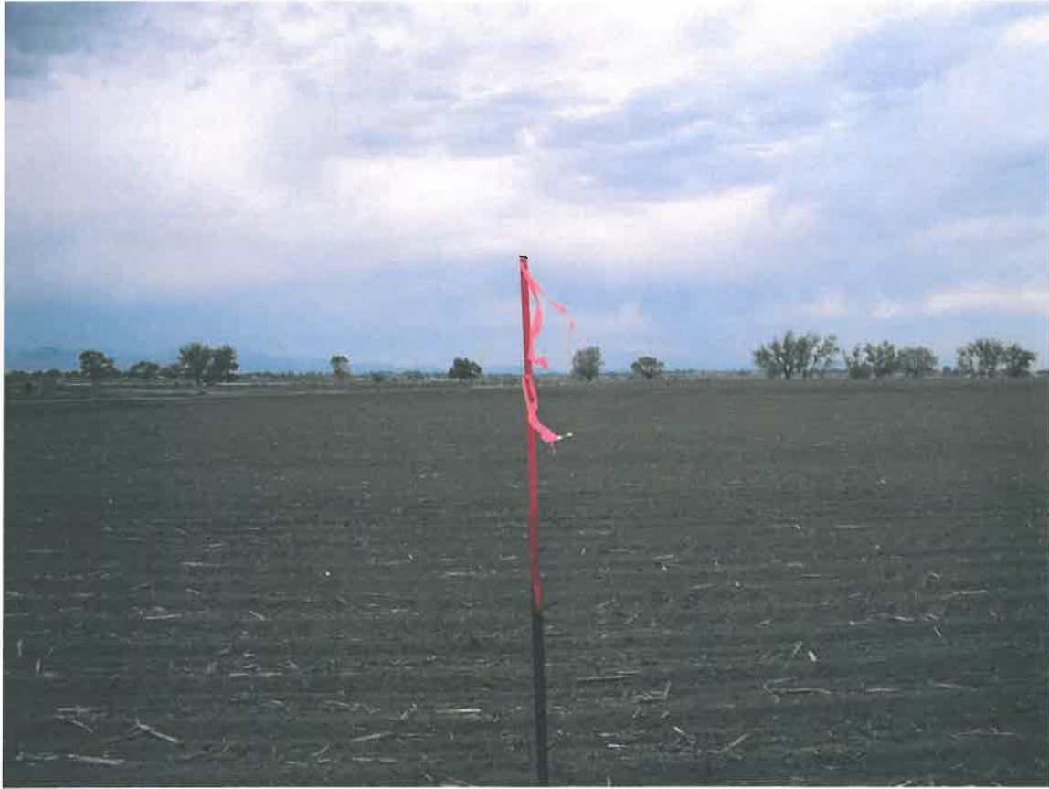
Figure 1: SRC UNION PAD LOOKING NORTH (SW1/4 NW1/4 SEC 5, T2N, R68W, 11-29-12)