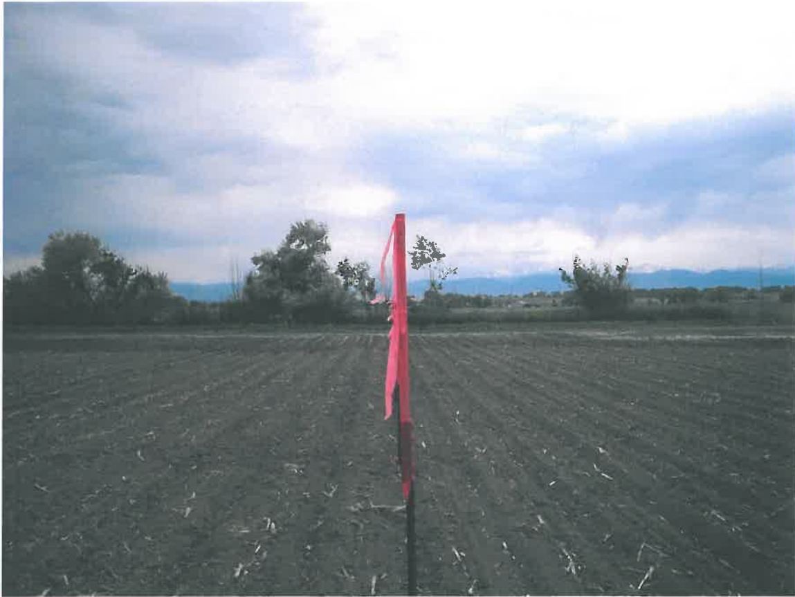
Figure 4: SRC UNION PAD LOOKING WEST TOWARD ACCESS ROAD (SW1/4 NW1/4 SEC 5, T2N, R68W, 11-29-12)