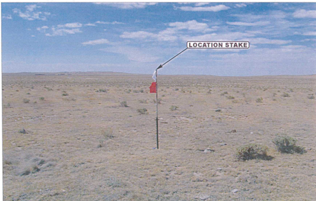
PHOTO: VIEW OF LOCATION STAKE